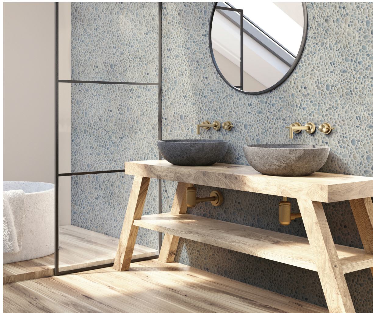
Pebble Mosaic in Blue