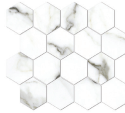
3" Hexagon Mosaic