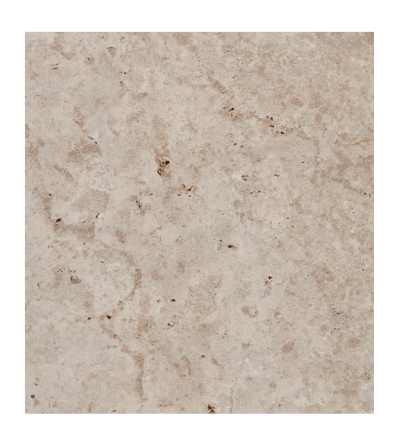
Perlato di Sicilia