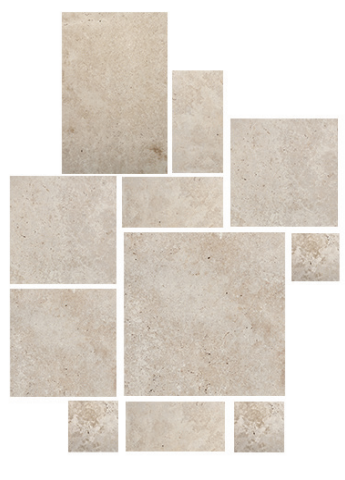
Perlato di Sicilia