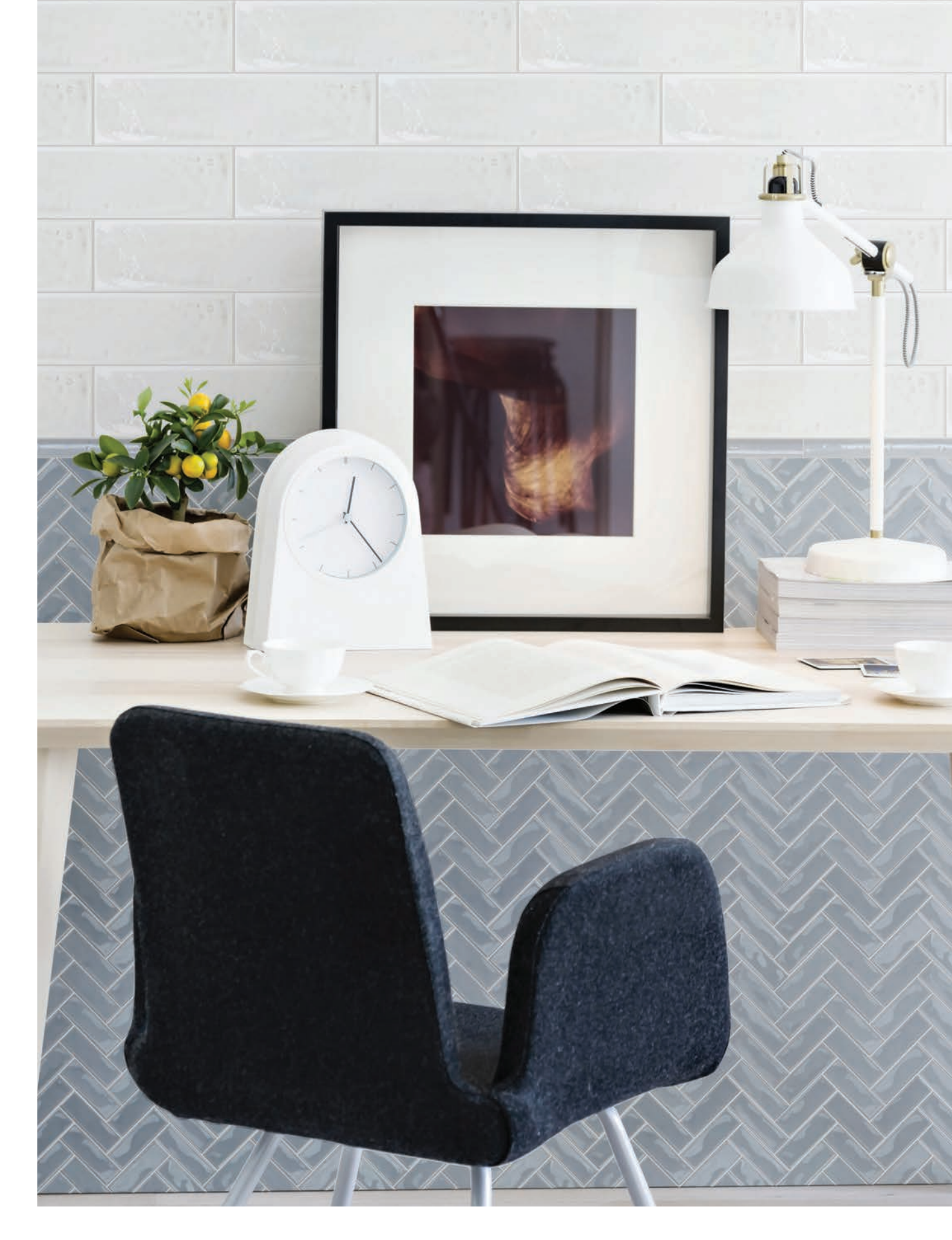
1"x3" Herringbone Mosaic | 0.75"x13" Pencil in Azzuro 3"x12.5" Wall Tile in Glossy White