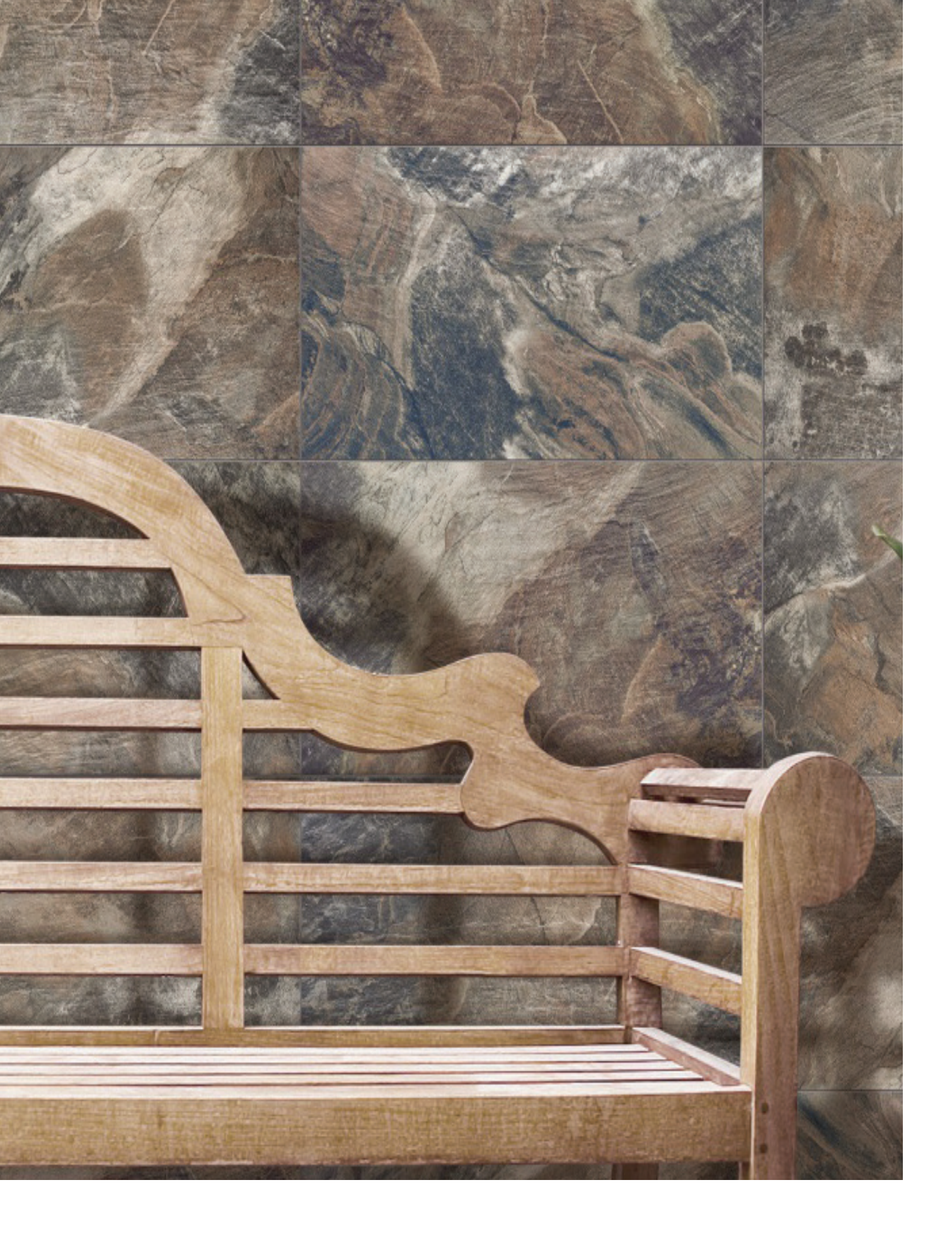
12"x22" Field Tile in Marron