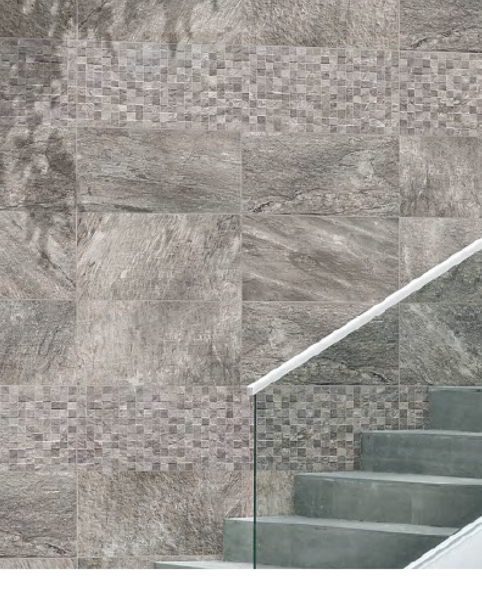
12"x22" Field Tile in Natural