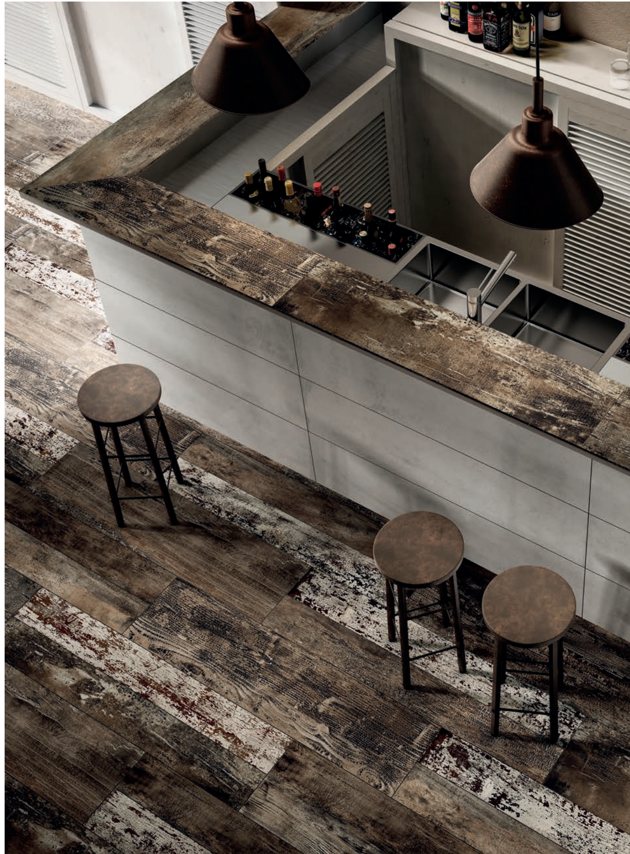
12"x48" Field Tile in Brown 6"x48" Field Tile in Brown | Brown Cracked