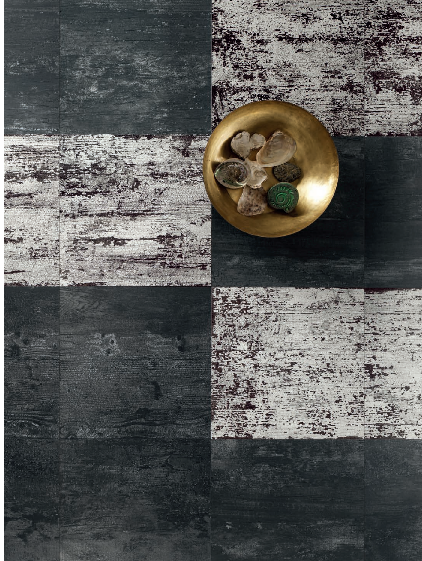
24"x24" Field Tile in Black | Black Cracked