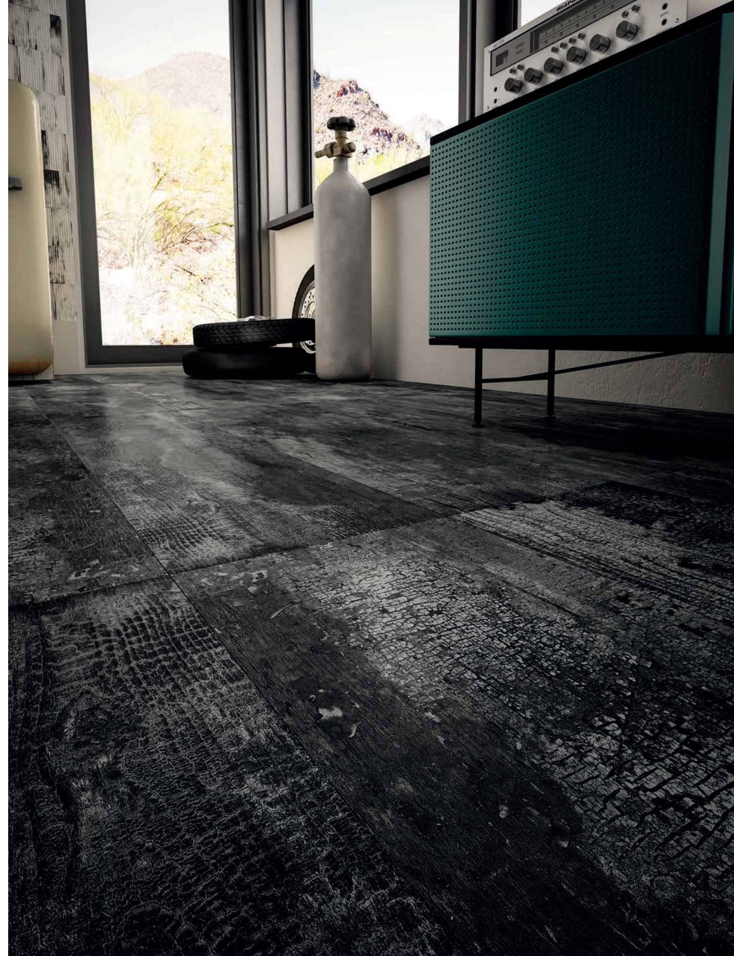
12"x48" Field Tile in Black