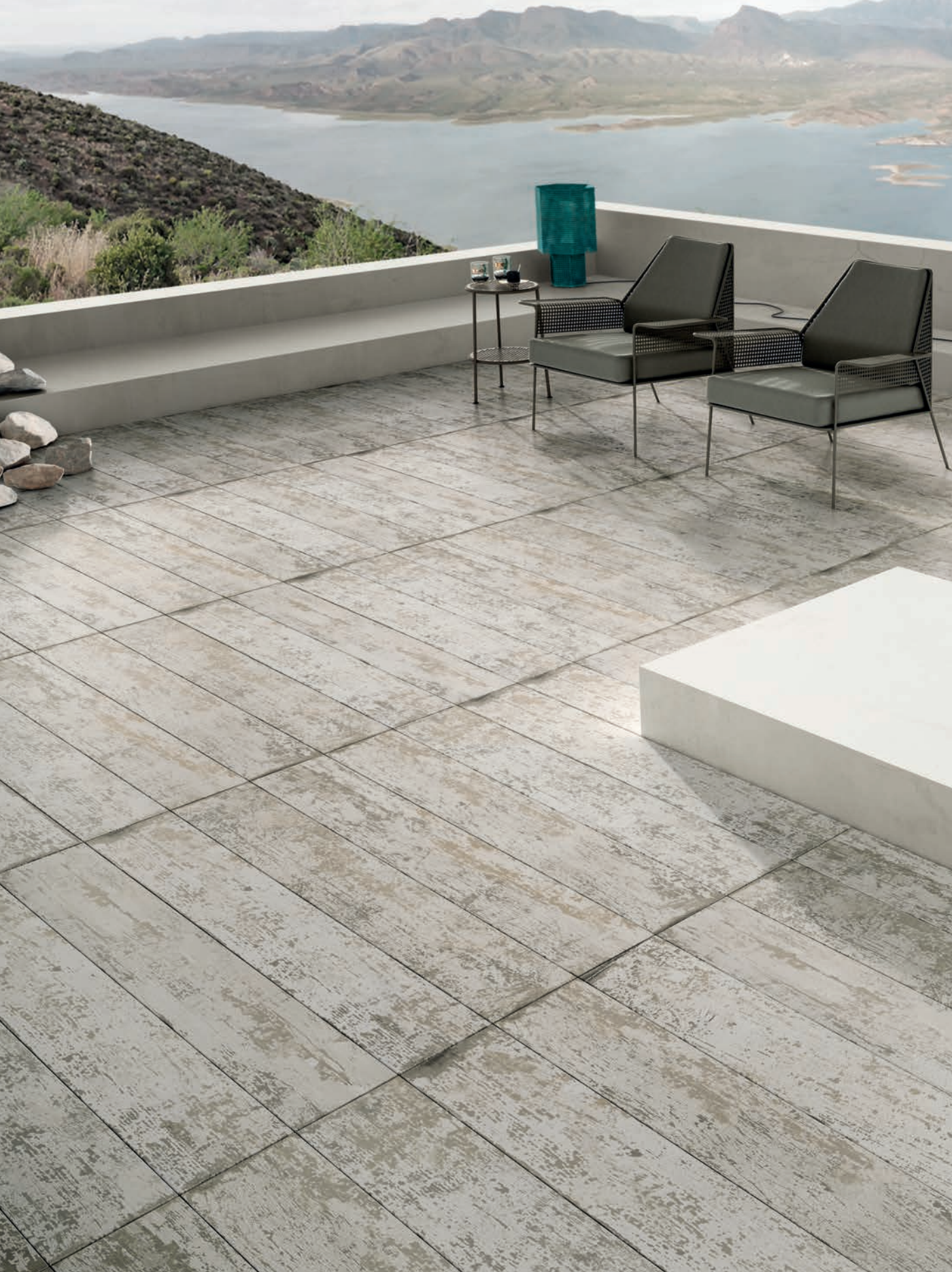
8"x48" Field Tile in Beige Cracked