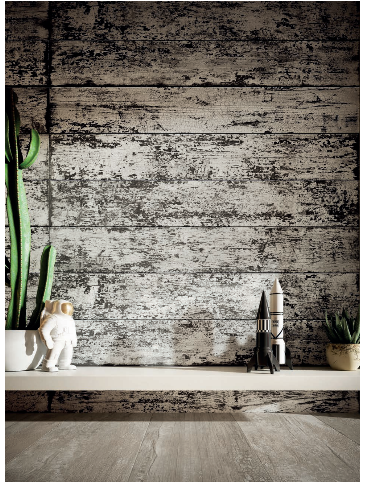
6"x48" Field Tile in Black Cracked 12"x48" Field Tile in Beige