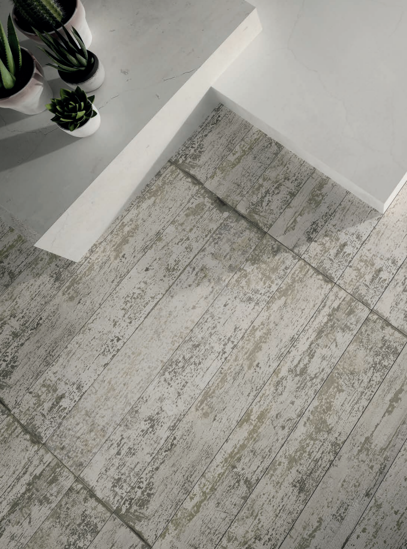
8"x48" Field Tile in Beige Cracked