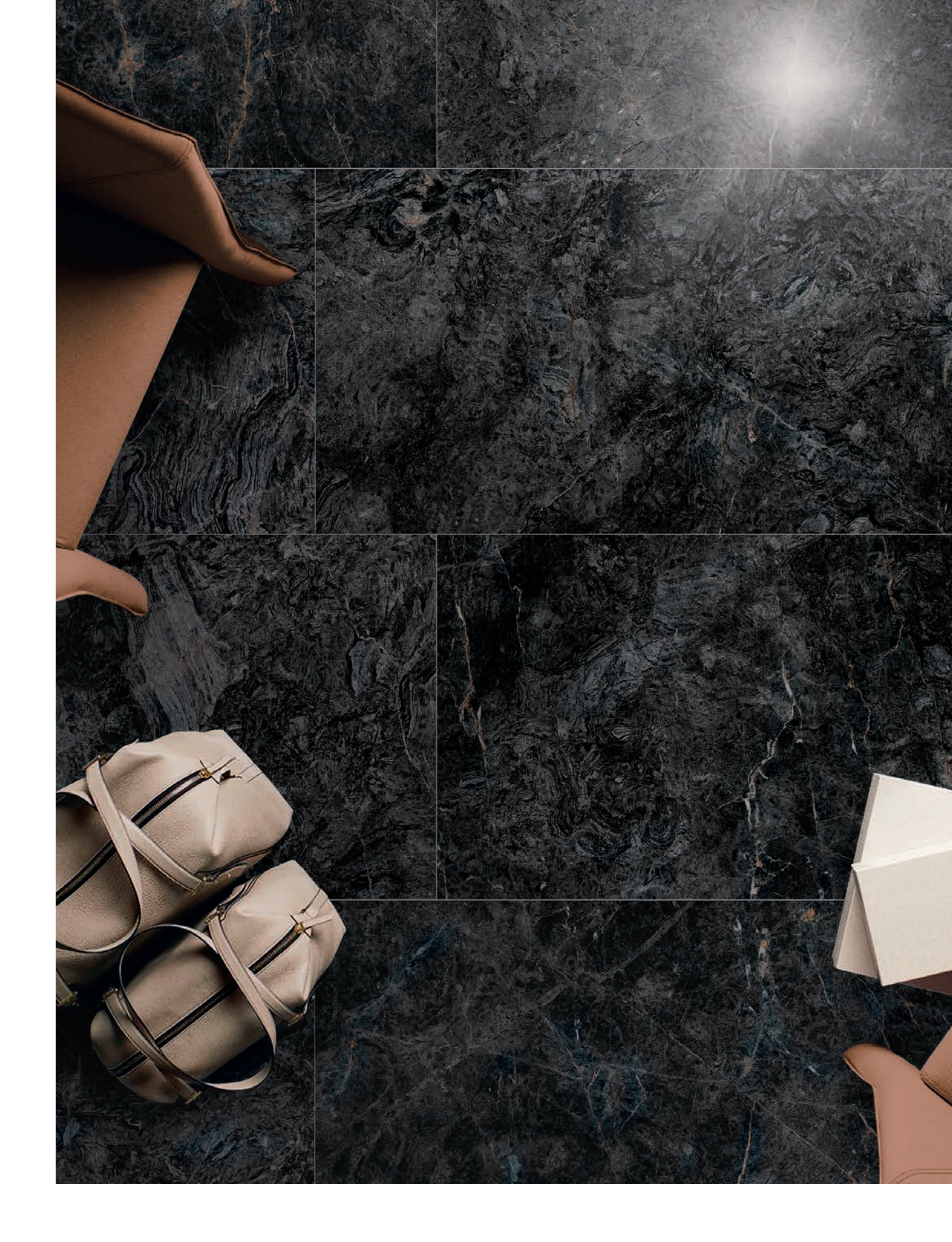
24"x48" Field Tile in Nero