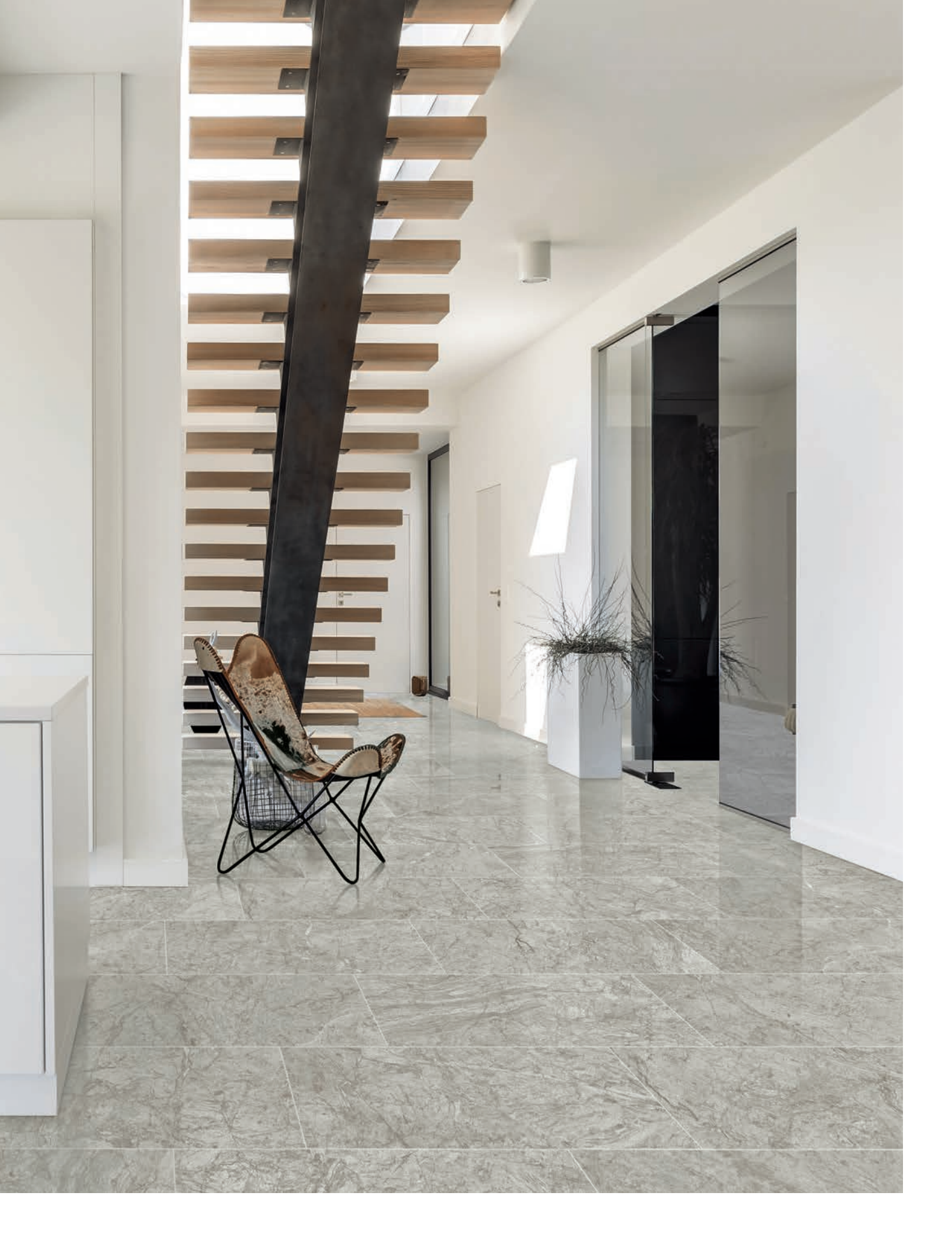
12"x24" Field Tile in Grigio