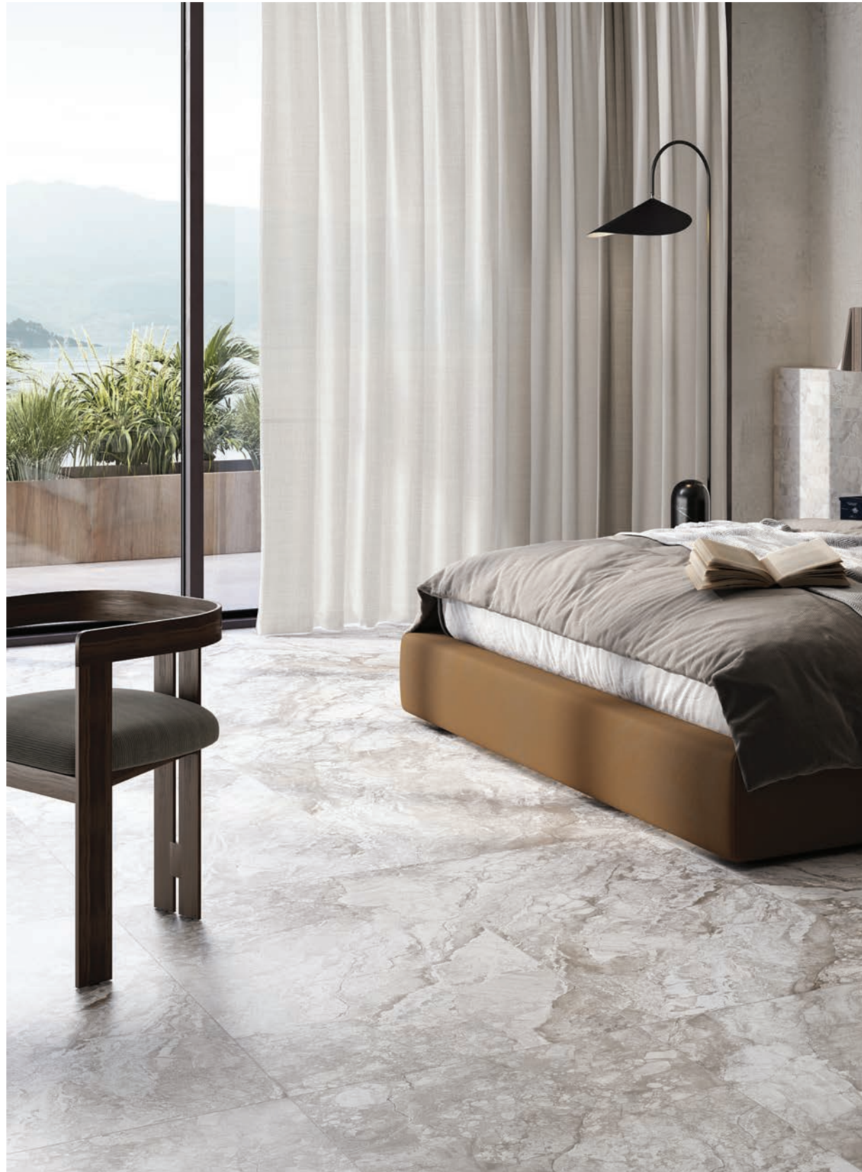
24" x 48" Field Tile in Grey