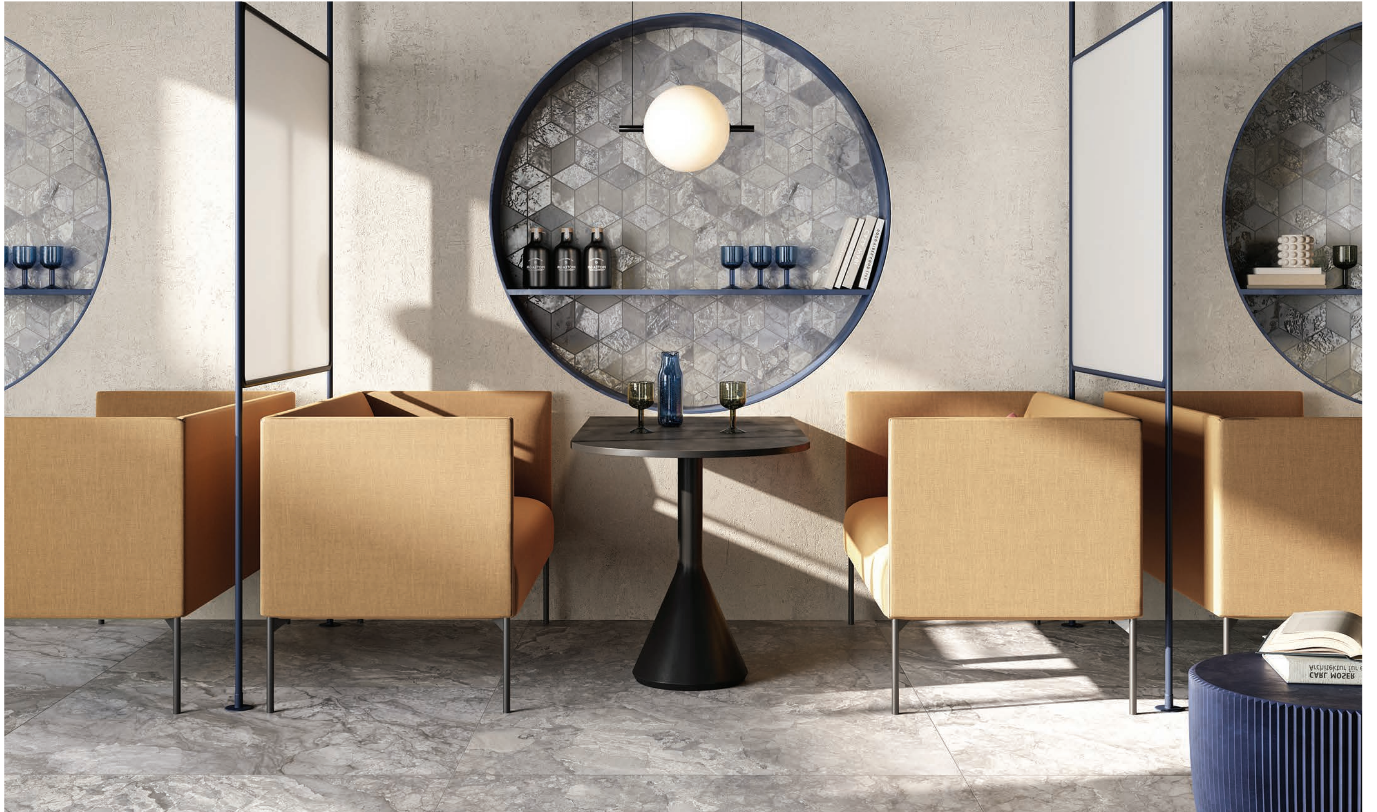
24"x48" Field Tile in Charcoal