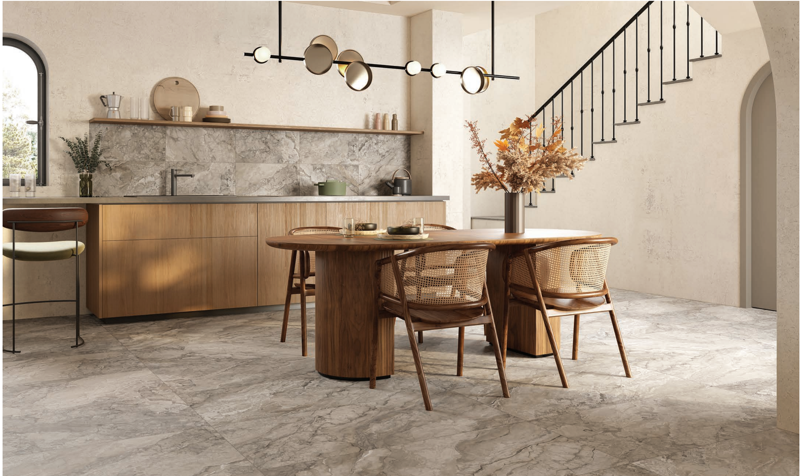
24"x48" Field Tile in Walnut