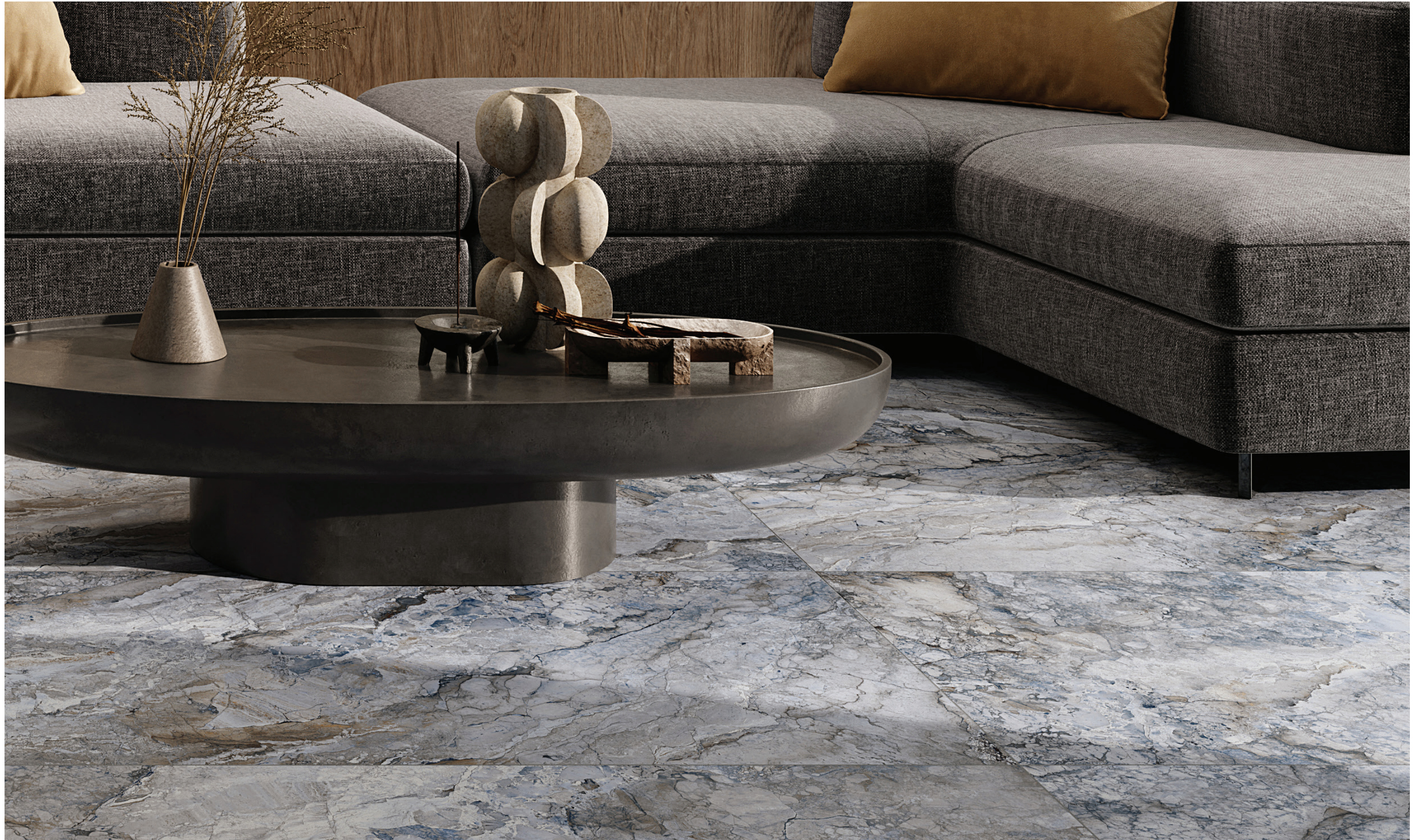
24"x48" Field Tile in Light Blue