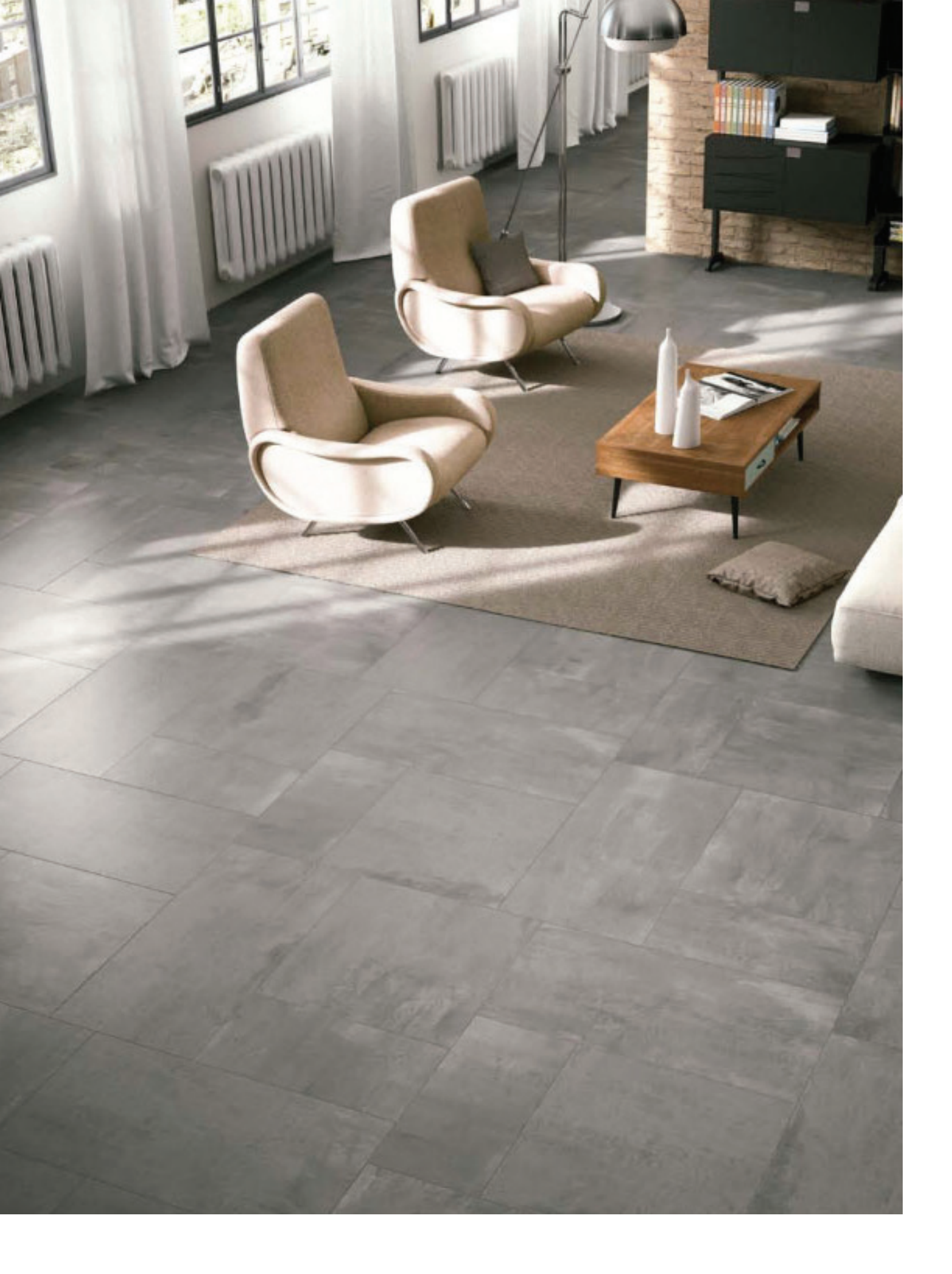
12"x24" | 18"x36" | 24"x24" Field Tile in G