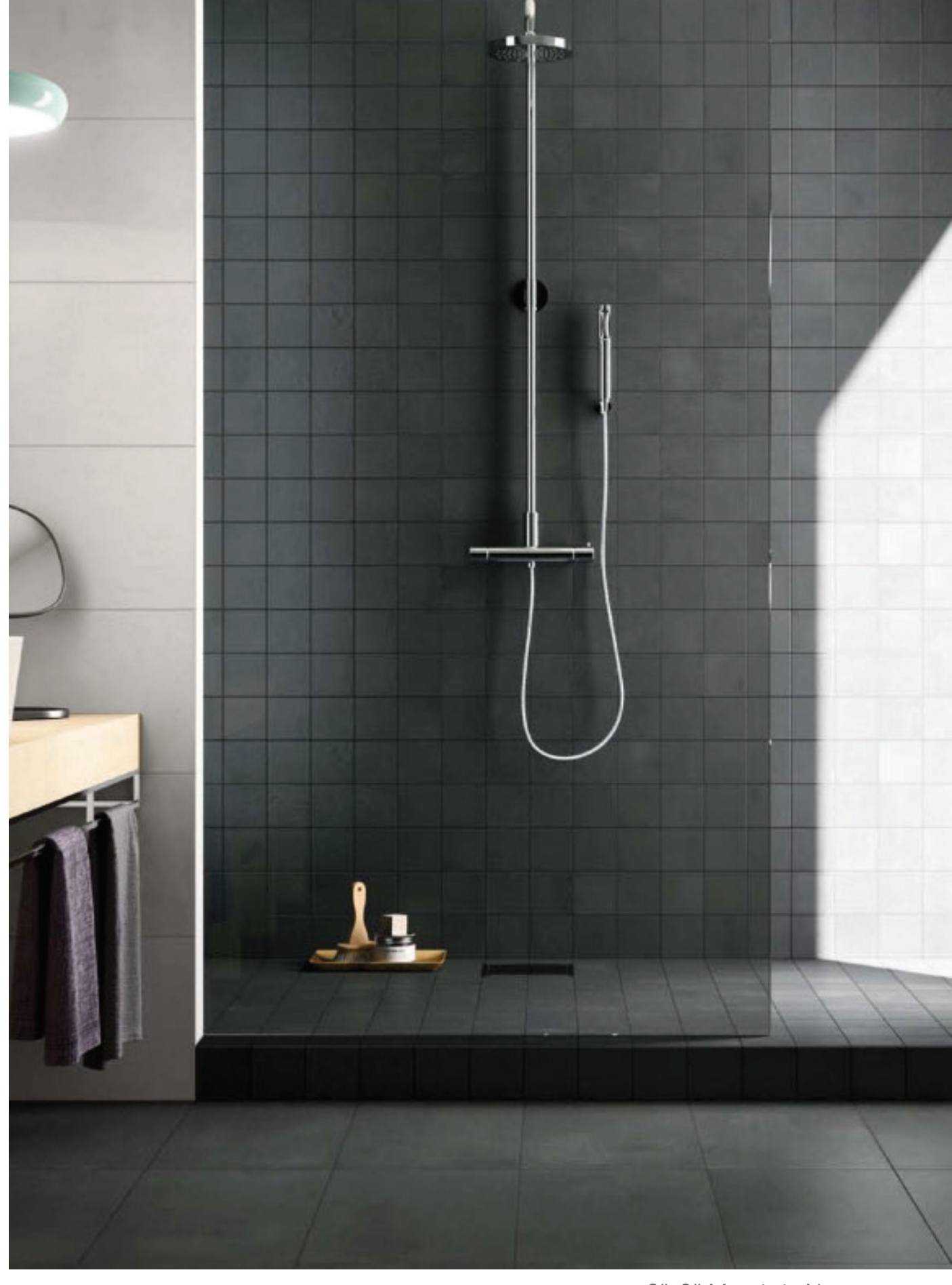
2"x2" Mosaic in N 12"x24" Field Tile in N 12"x24" Field Tile W