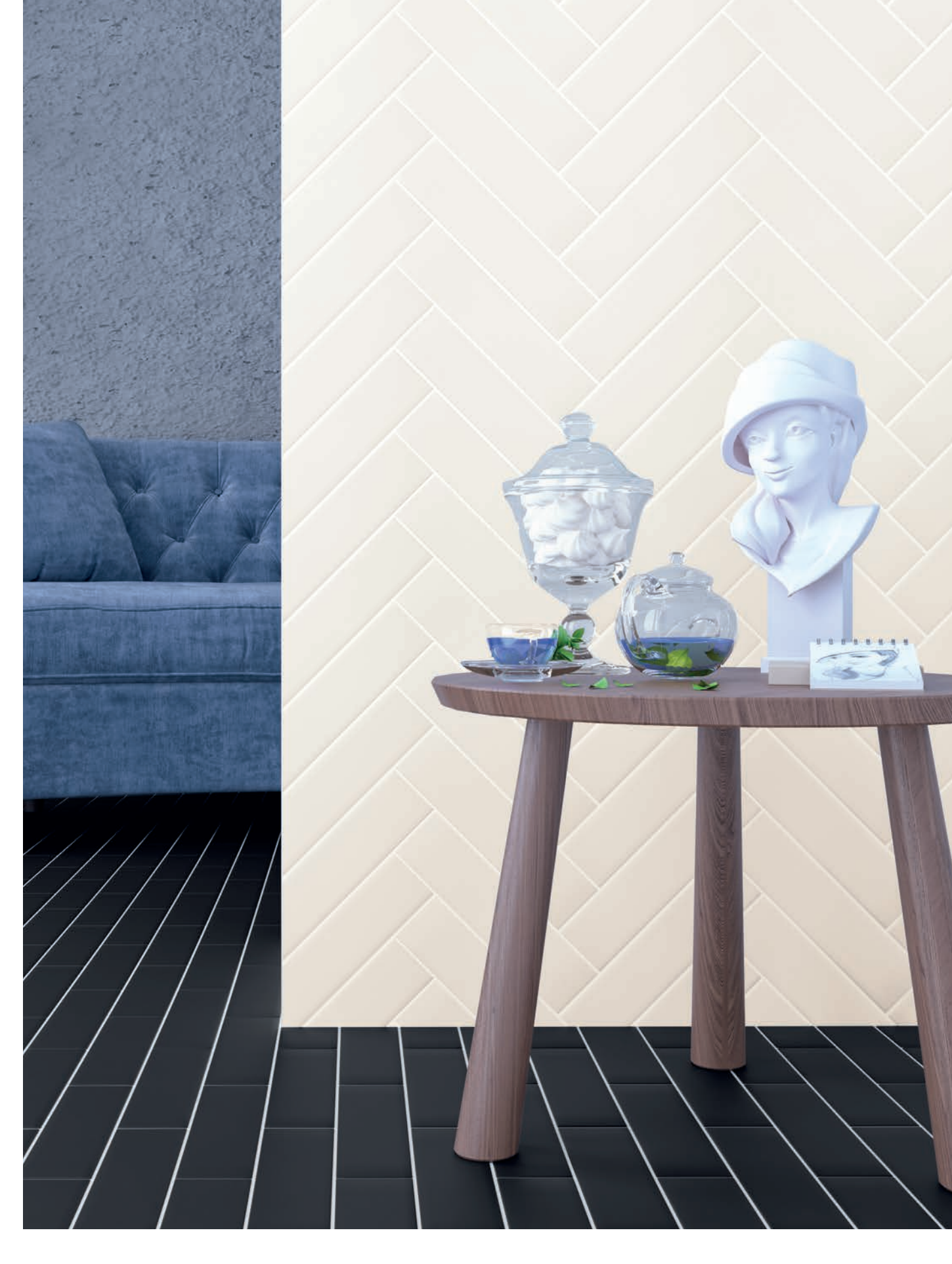
2.5"x10.5" Tile in White 2.5"x10.5" Tile in Sage