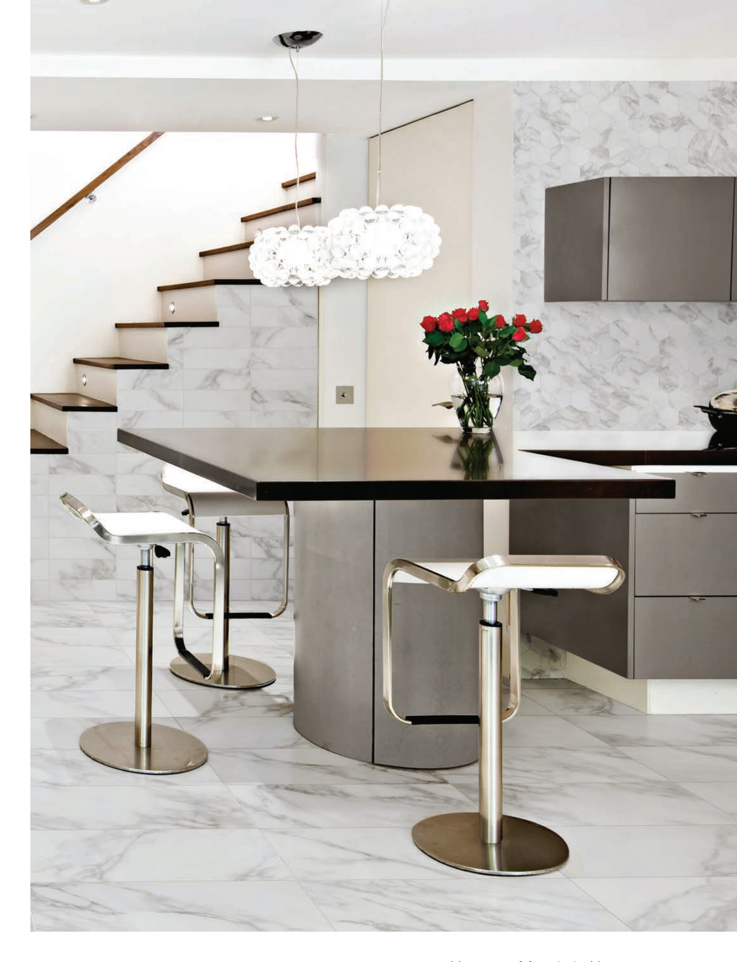
Hexagon Mosaic in Honesty 12"x24" | 3.75"x12"Field Tile in Honesty