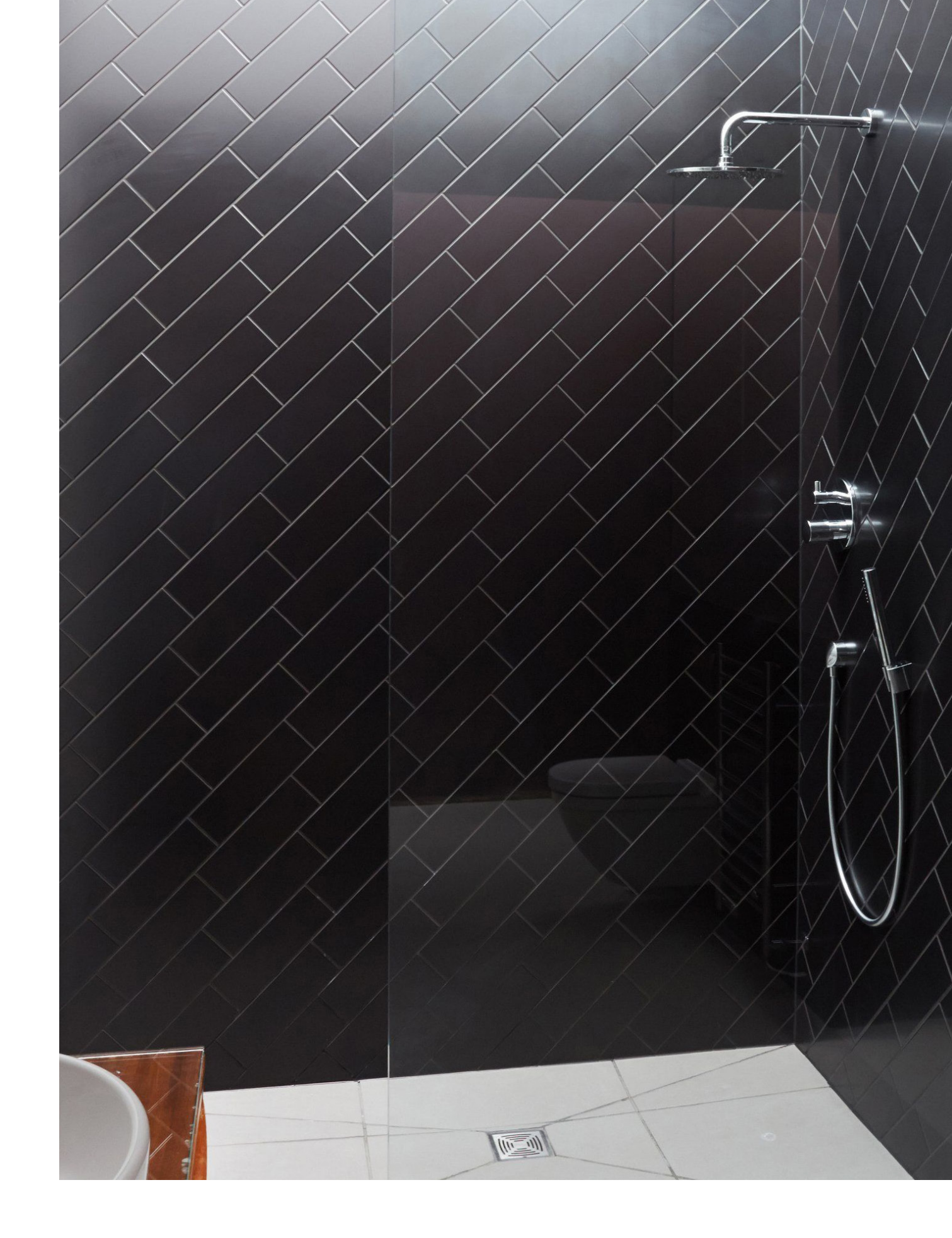
4"x12" Wall Tile in Arctic | Saffron | Sunset | Ocean