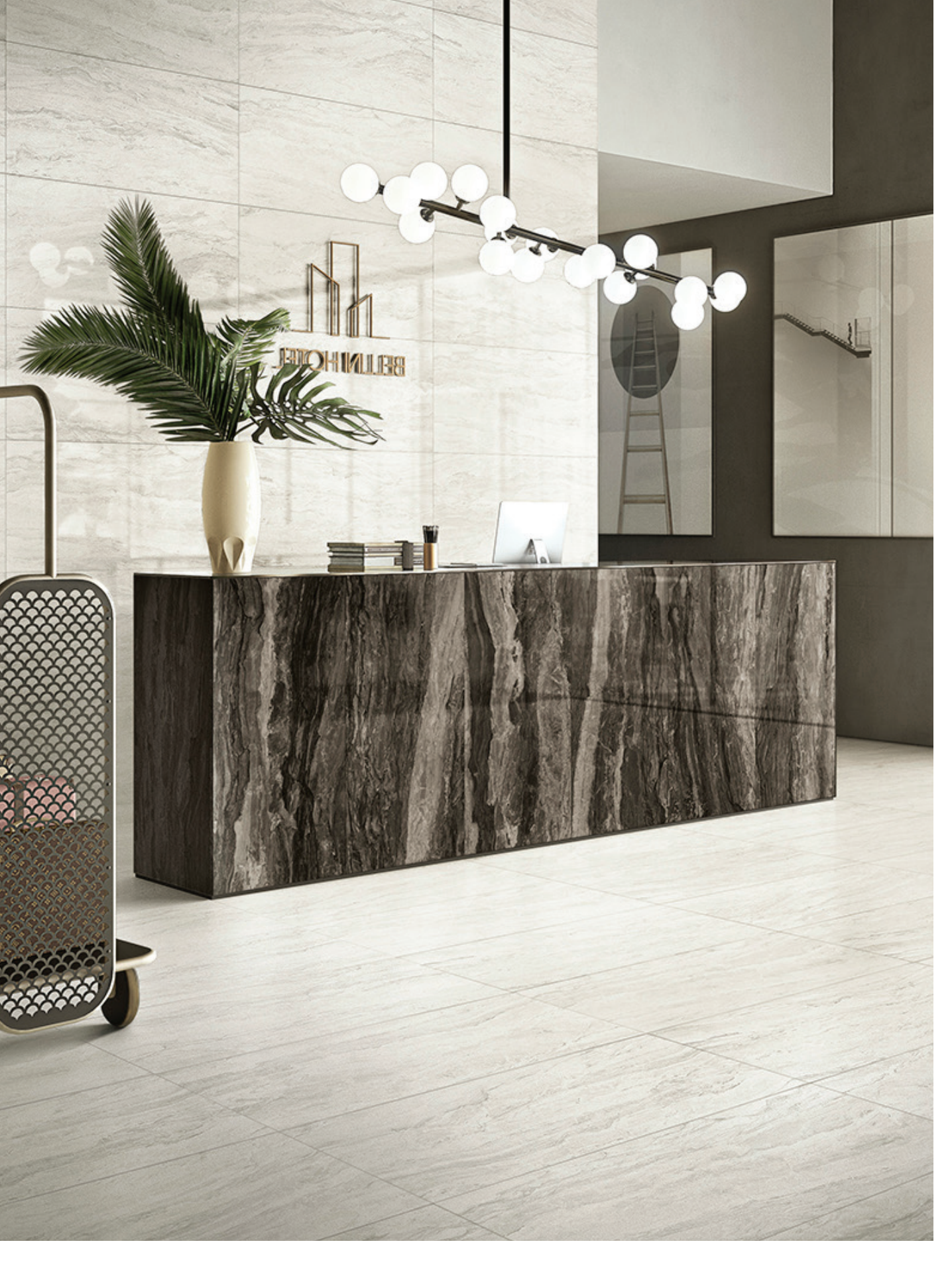
24"x46.1" Field Tile in Matte White 24"x46.1" Field Tile in Polished White I Mink