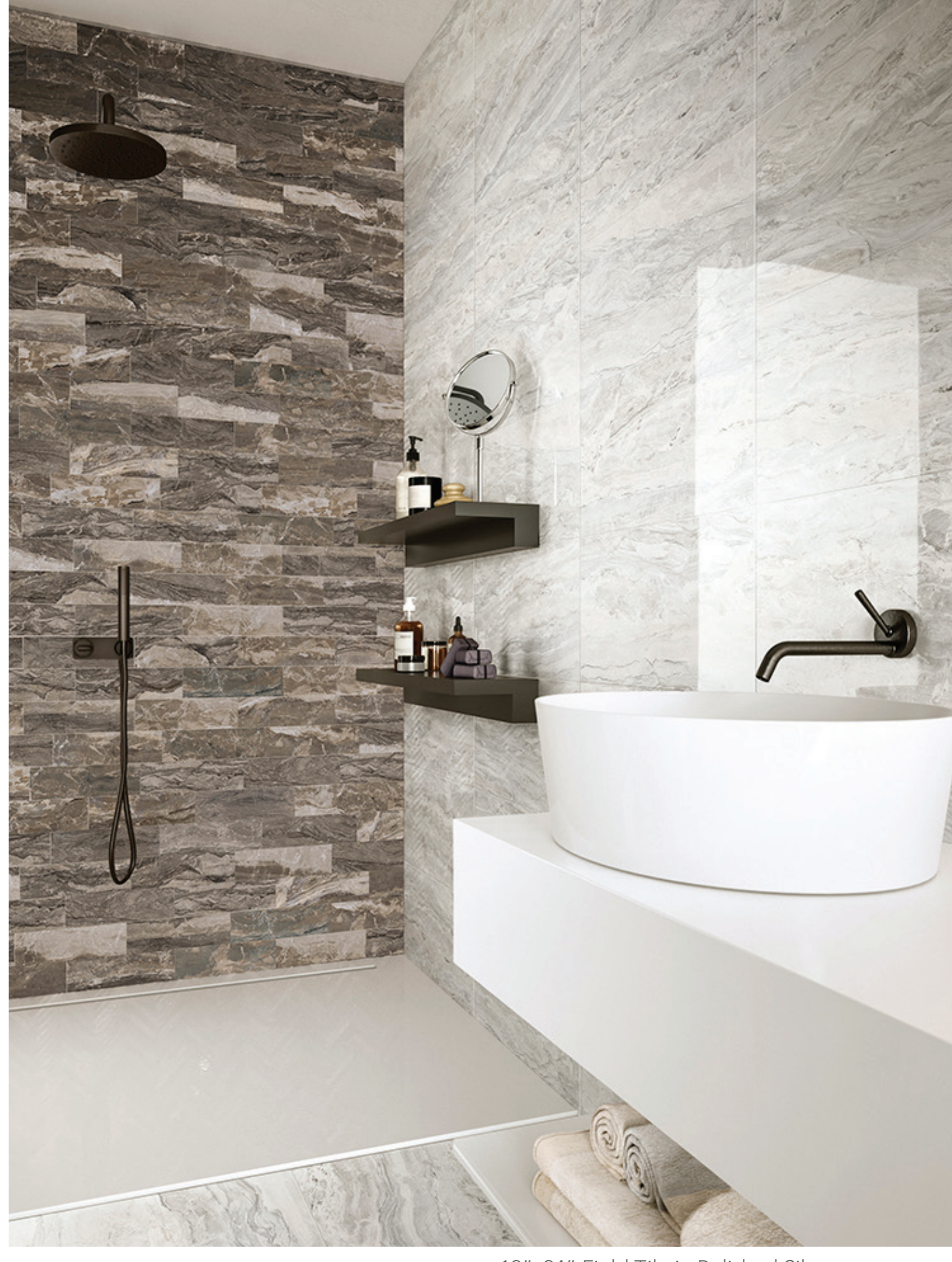
12"x24" Field Tile in Polished Silver 24"x24" Field Tile in Matte Silver 3"x12" Field Tile in Polished Mink