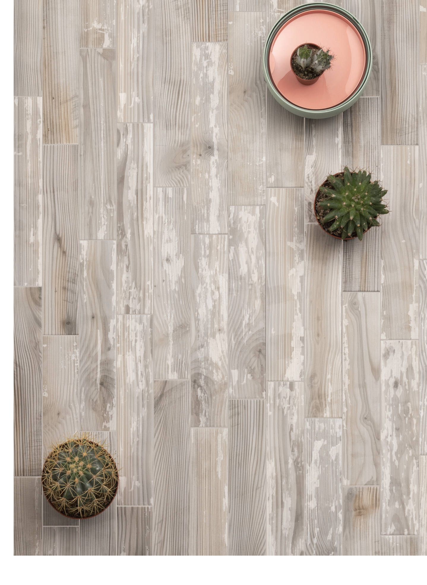
Wood 2.4"x11.8" Field Tile in Beige