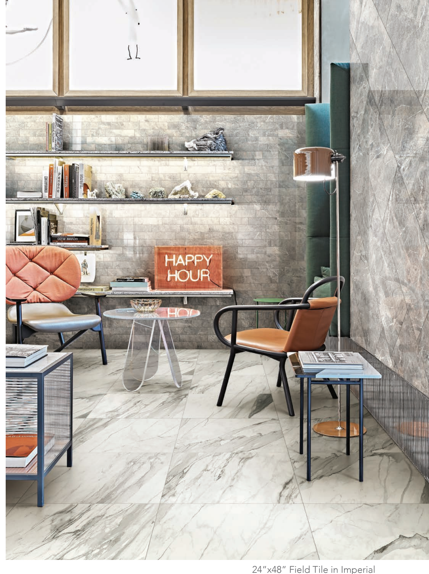
24"x48" Field Tile in Imperial 24"x24" Field Tile in Apuano 3"x12" Field Tile in Imperial