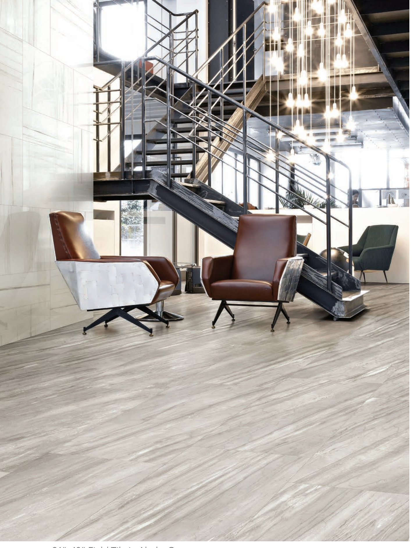
24"x48" Field Tile in Alaska Grey 24"x24" Field Tile in Dolomite 12"x24" Field Tile in Dolomite