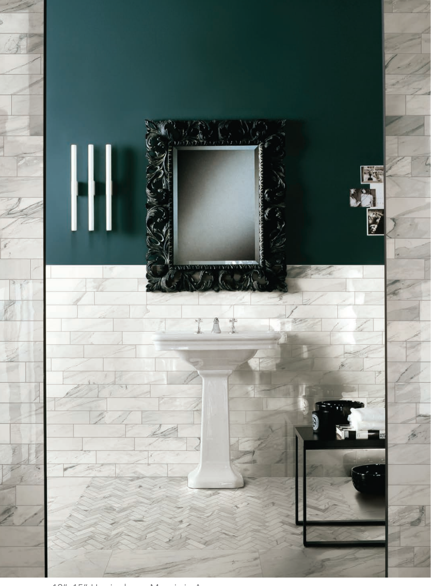
12"x15" Herringbone Mosaic in Apuano 3"x12" Field Tile in Apuano 12"x24" Field Tile in Apuano