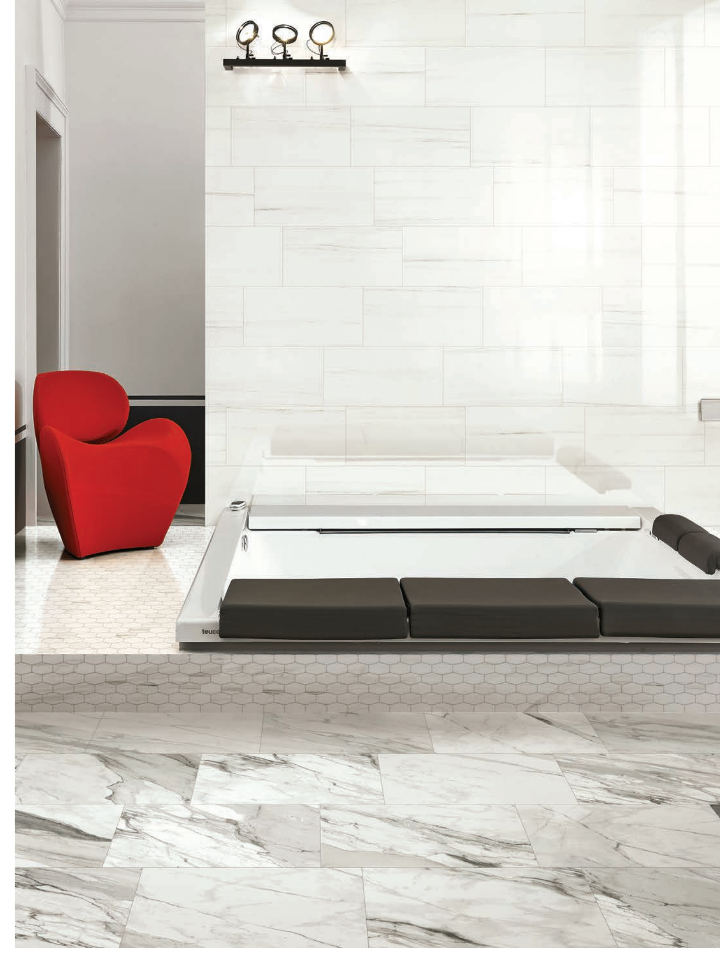
12"x11" Elongated Hexagon Mosaic in Dolomite 12"x24" Field Tile in Dolomite I Apuano