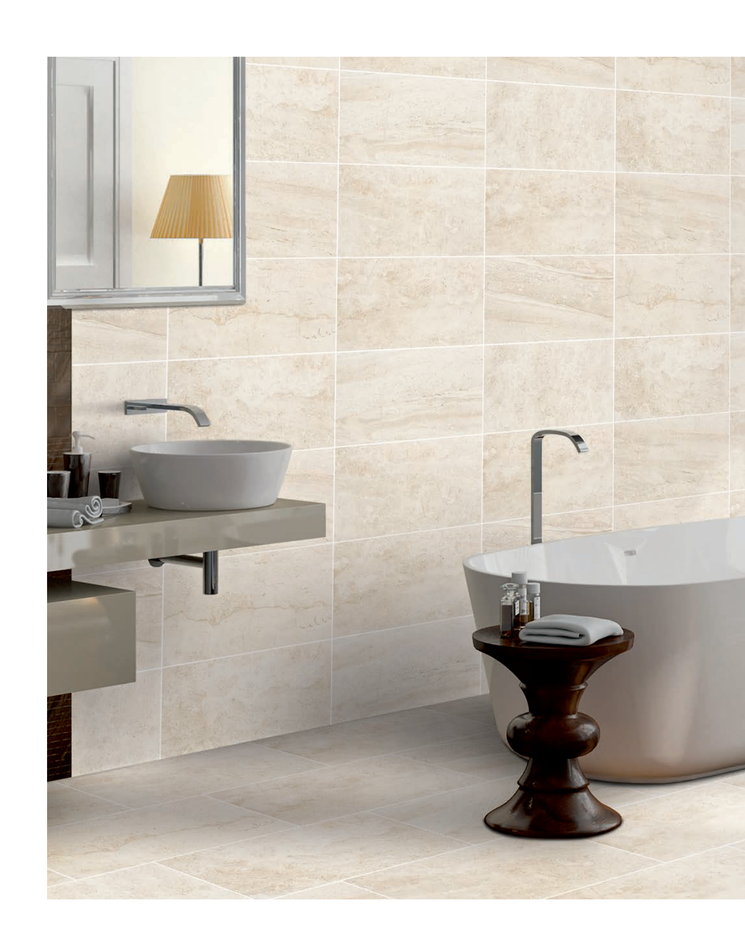
12"x24" Field Tile in Crosscut Travertine