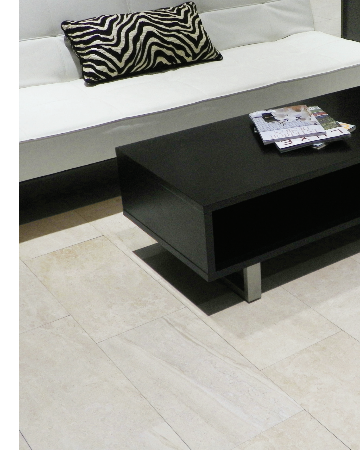
12"x24" Field Tile in Crosscut Travertine