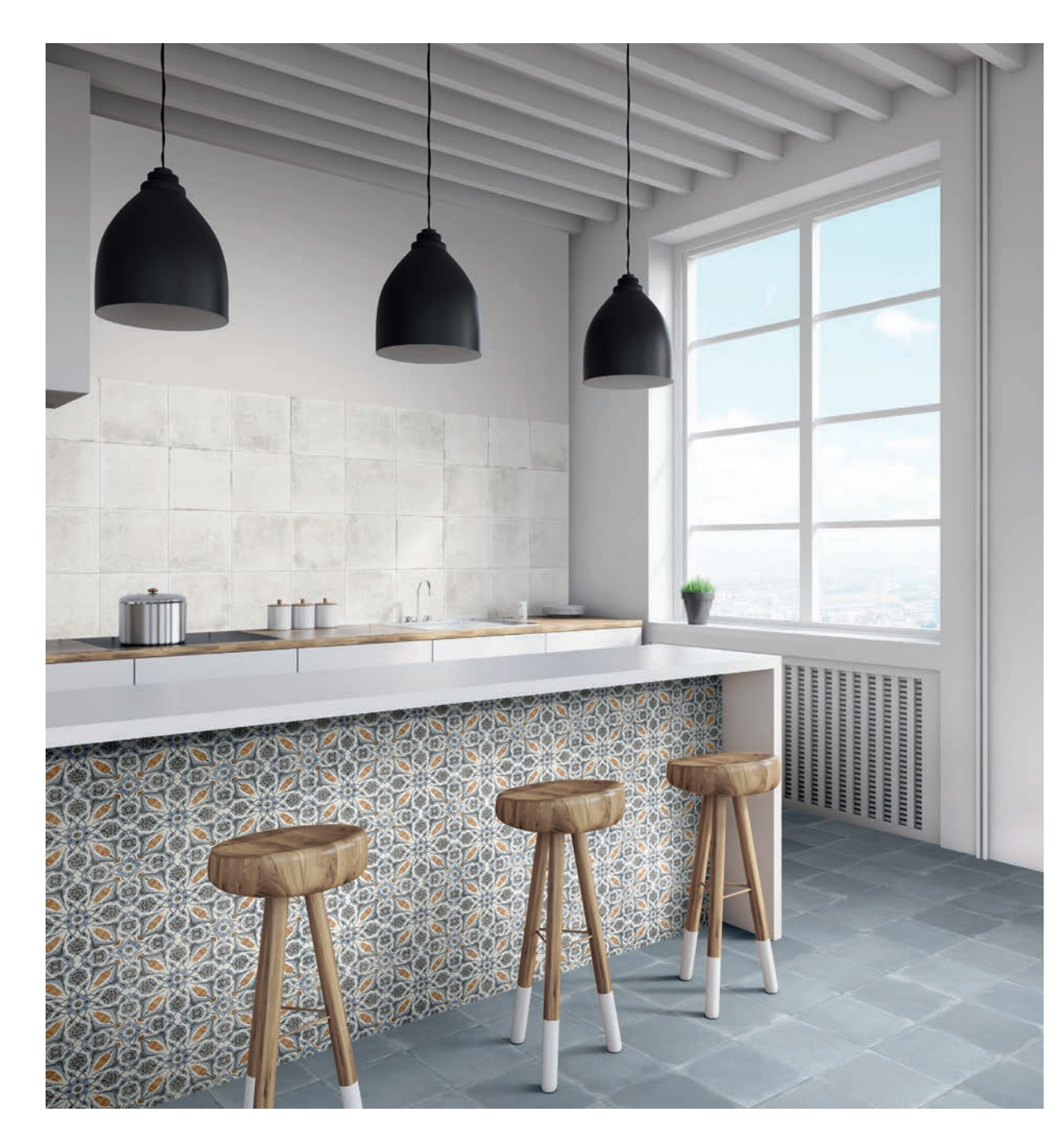
8"x8" Deco in Vin5 8"x8" Field Tile in Avio | Bianco