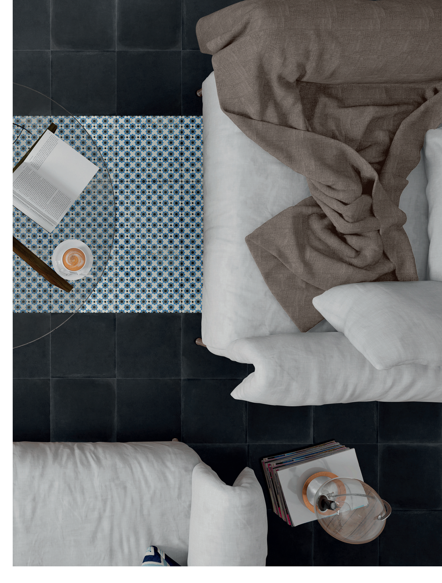
8"x8" Deco in Vin1 8"x8" Field Tile in Nero