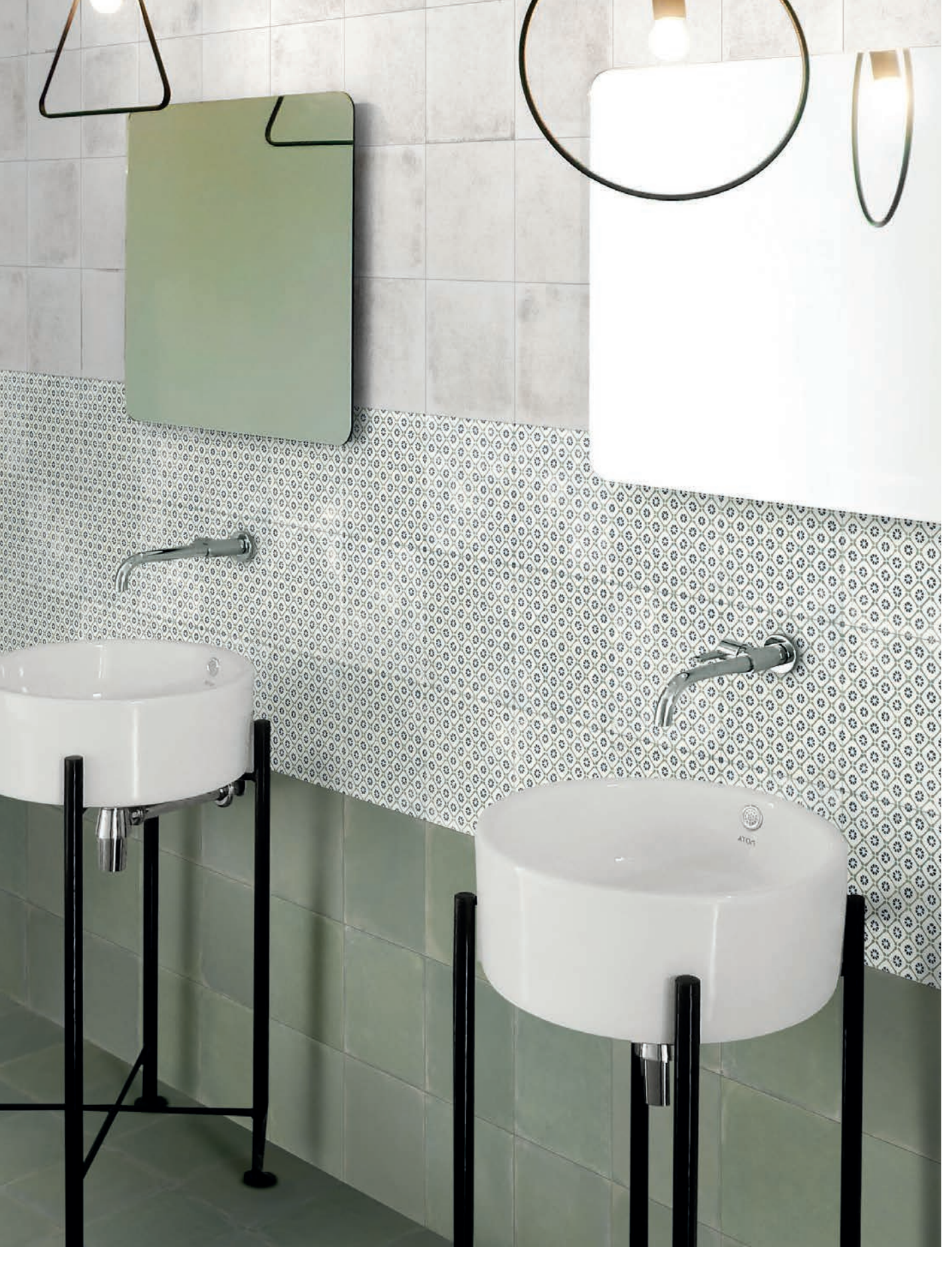
8"x8" Deco in Vin16 8"x8" Field Tile in Verde | Bianco