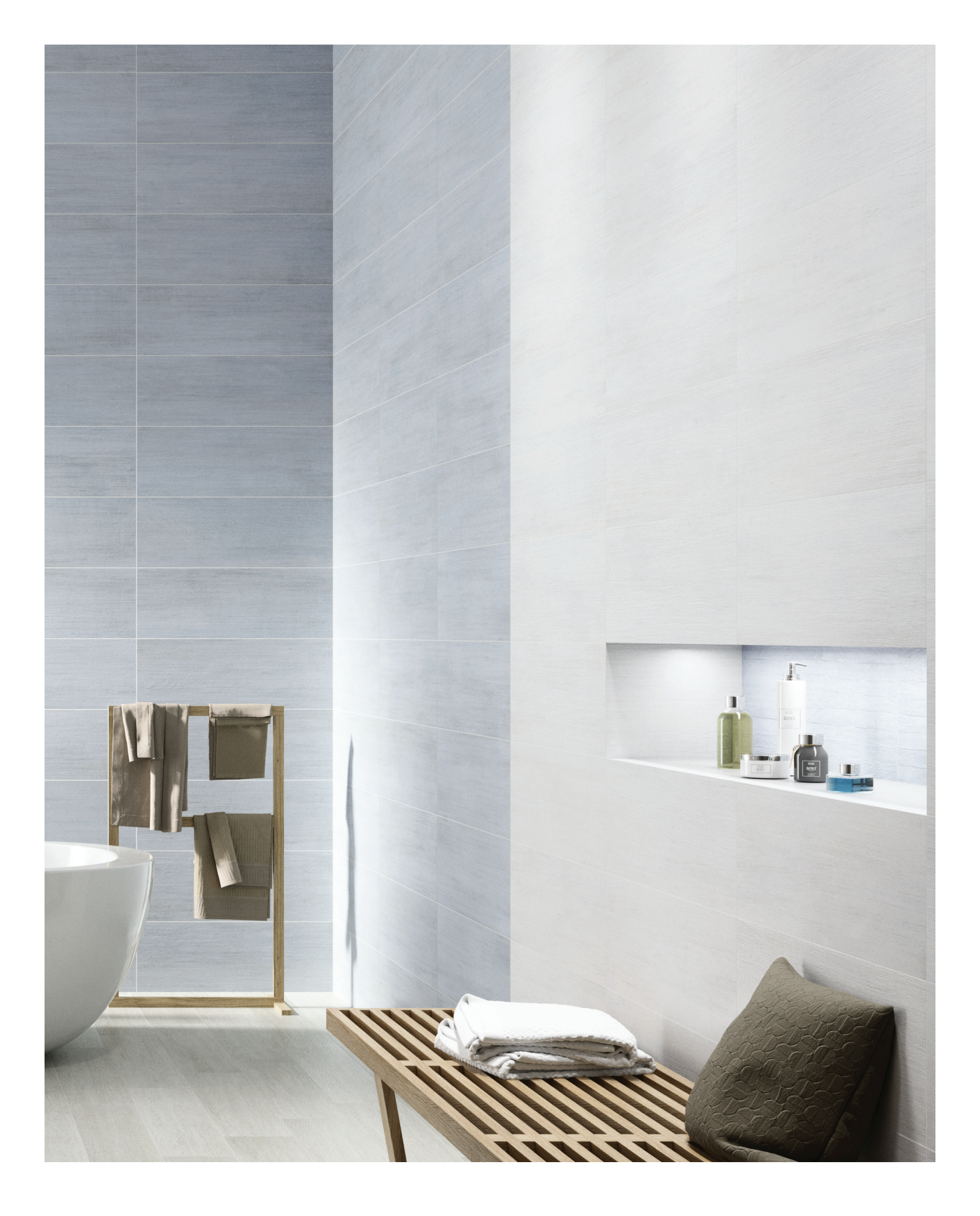
10"x28" Field Tile in Azul | Bianco