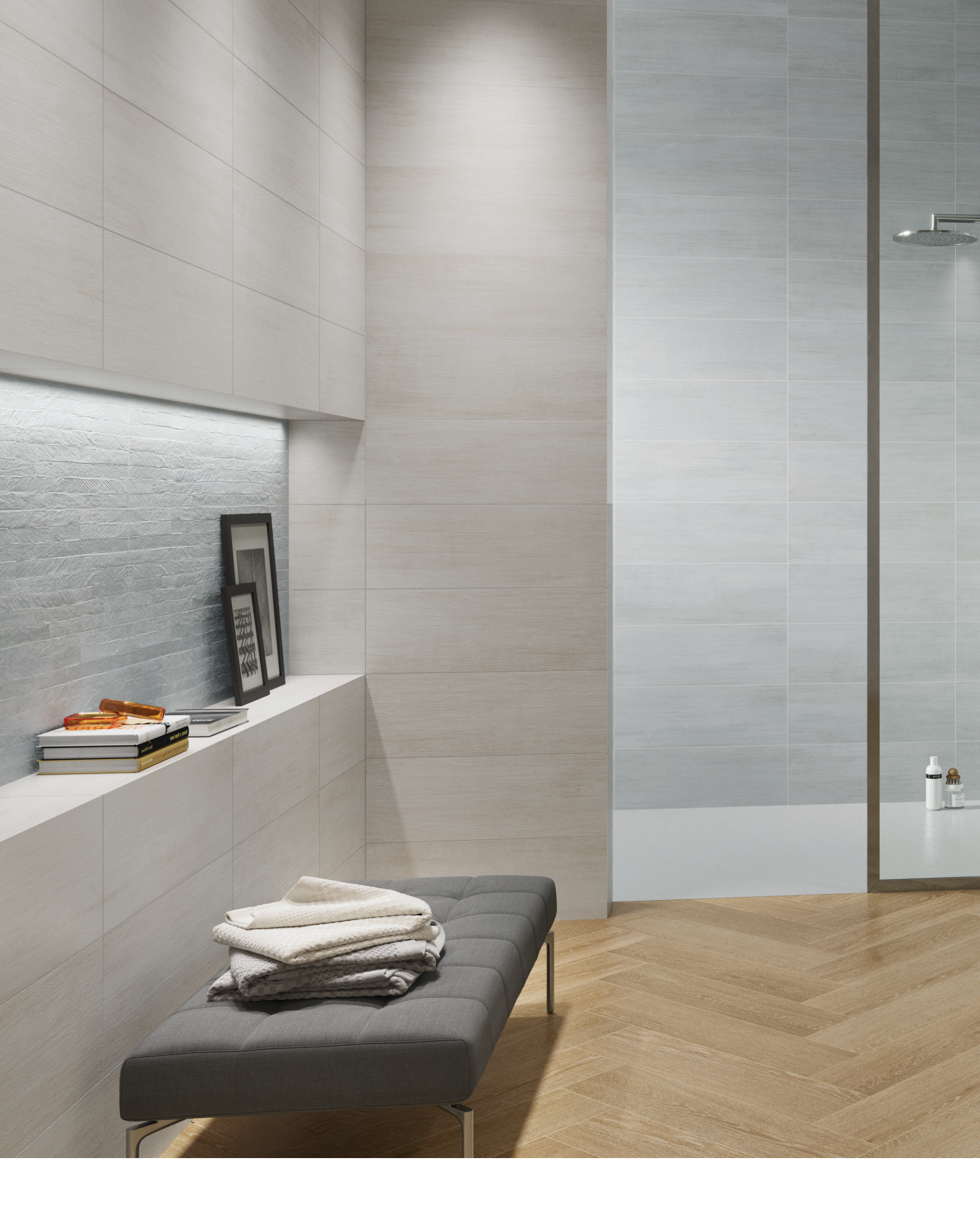
10"x28" Field Tile in Crema