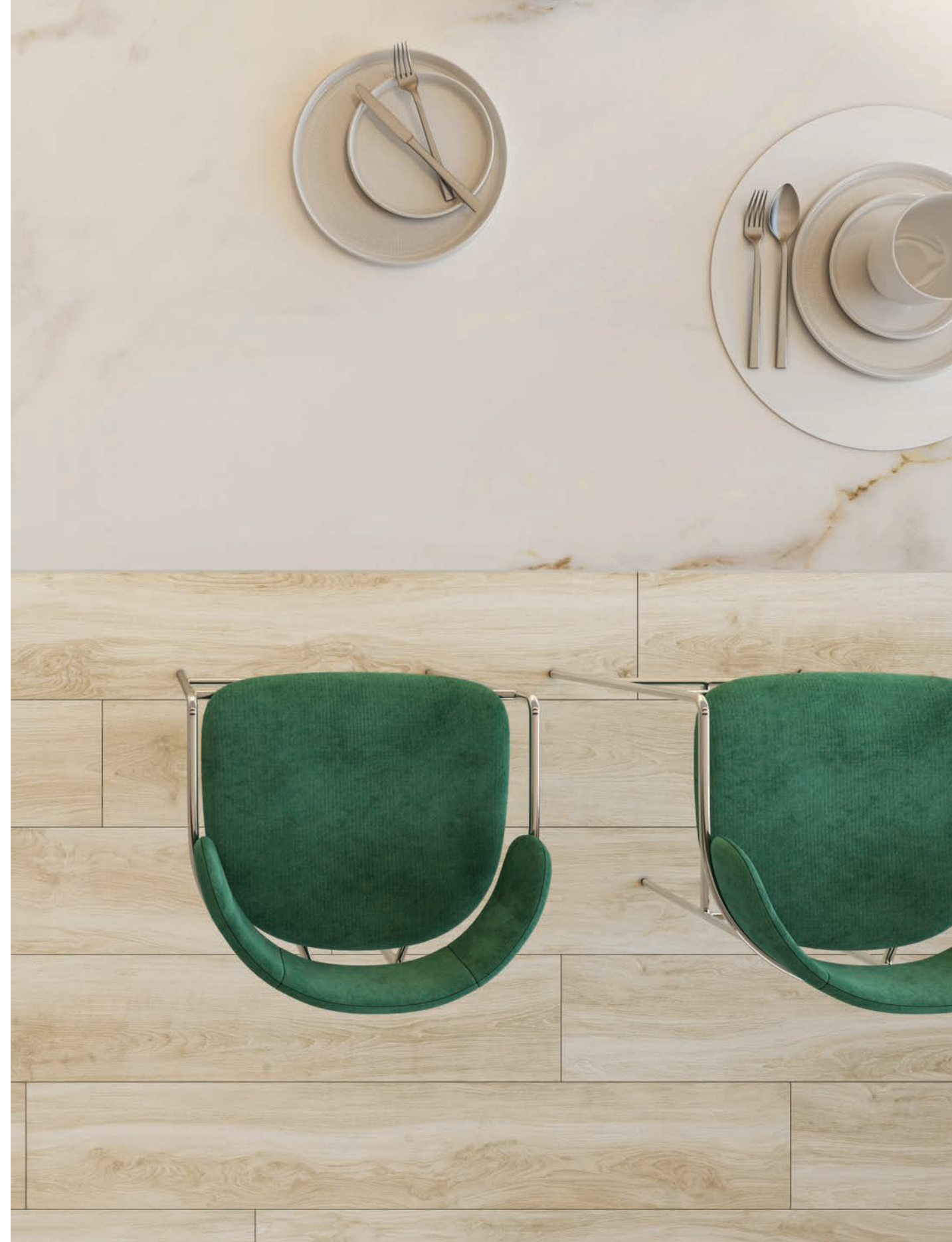
8" x 48" Field Tile in Haya