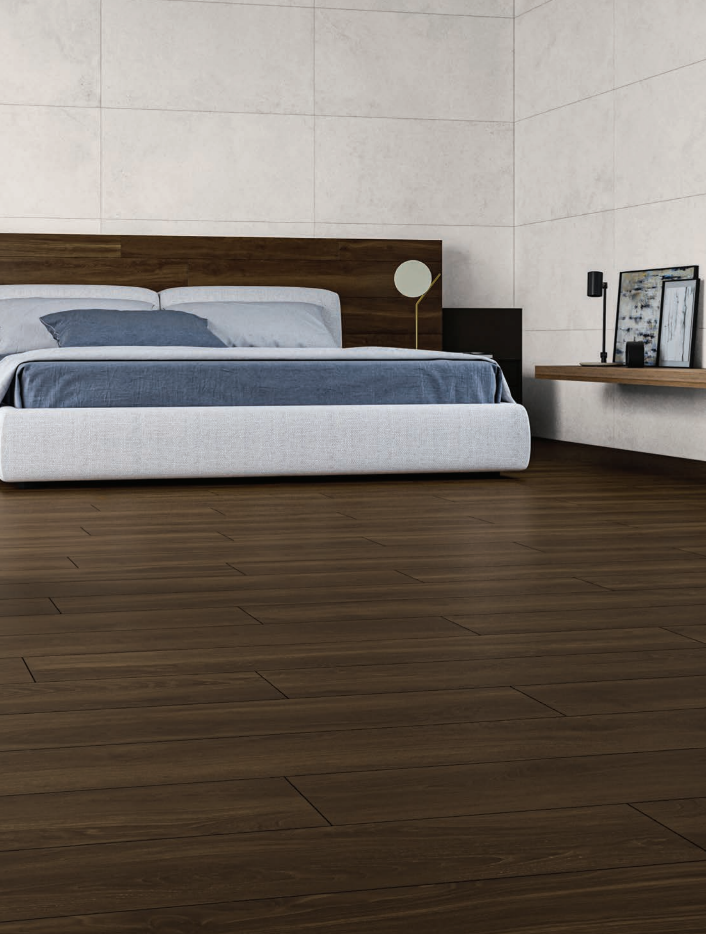
8" x 48" Field Tile in Encina