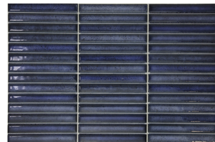
Grout Between Tile