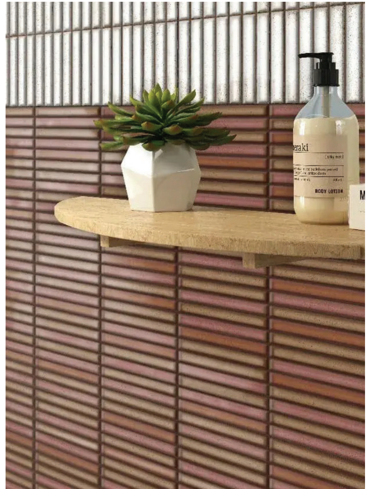
4.5" x 9" Wall Deco in Chalky 4.5" x 9" Wall Deco in Rusty Red