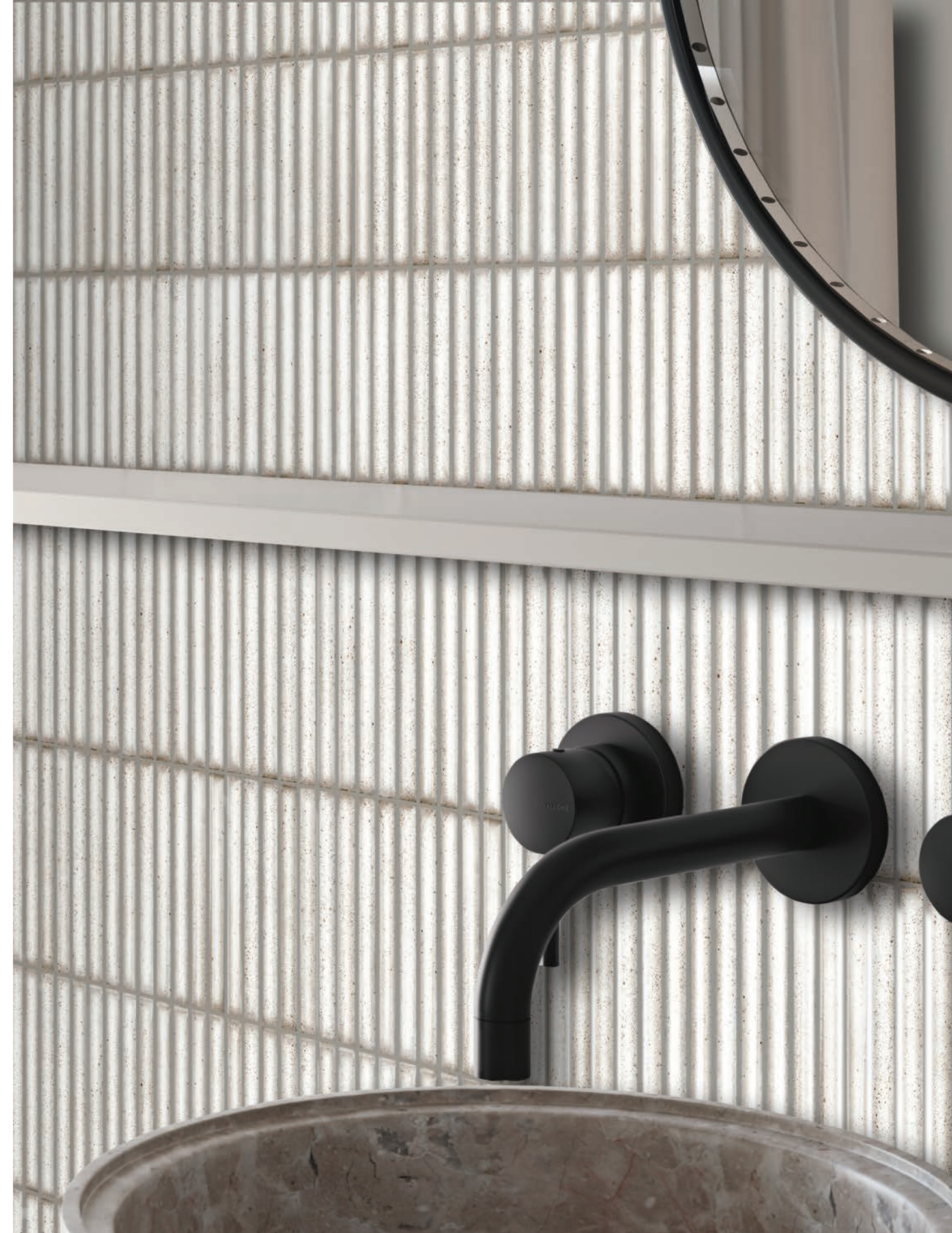
4.5" x 9" Wall Deco in Chalky