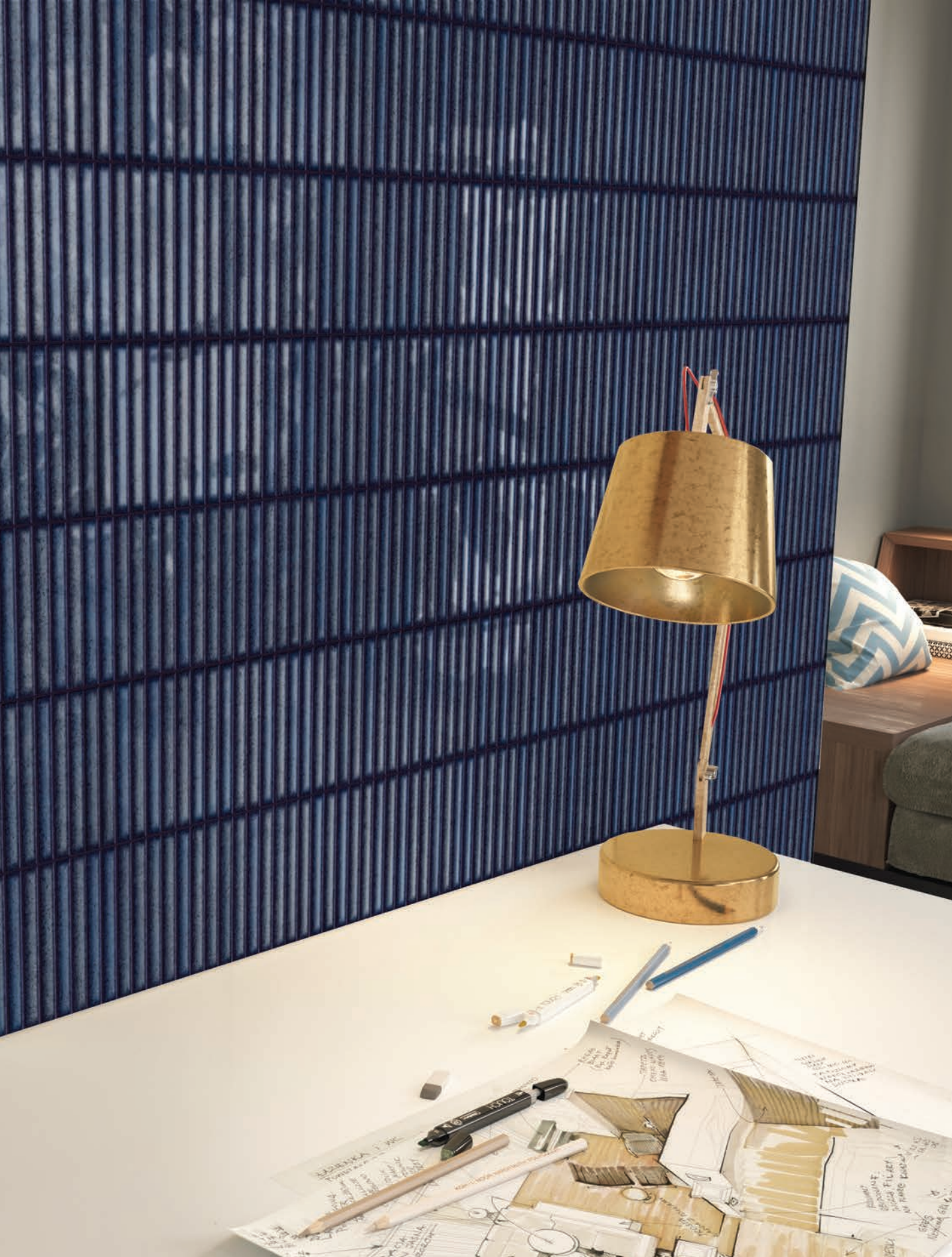
4.5" x 9" Wall Deco in Midnight