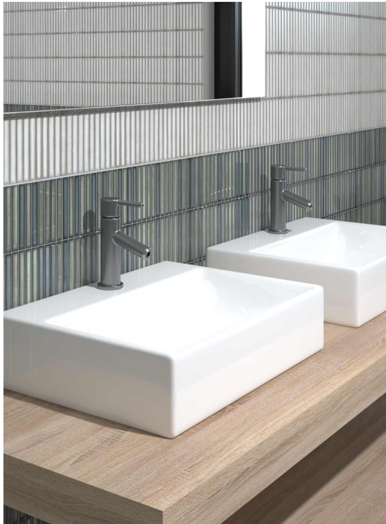
4.5" x 9" Wall Deco in Chalky 4.5" x 9" Wall Deco in Wear