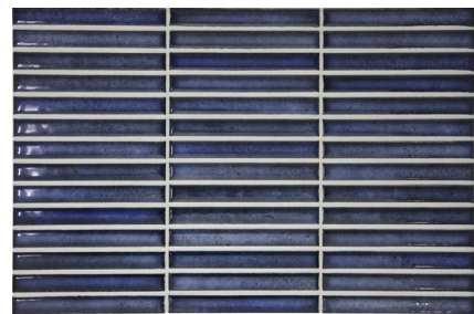
Grout Between Finger Grooves

V3 - Moderate variation is inherent in this tile. All material must be inspected prior to installation. Absolutely no claims will be accepted after installation.