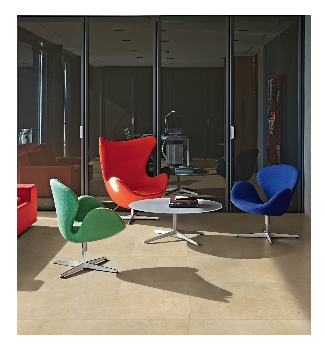
12"x24" Field Tile in Marfil 24"x24" Field Tile in Marfil