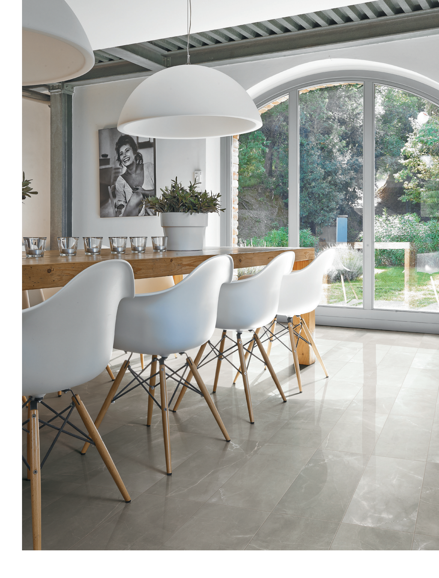
12"x24" Field Tile in Amani Bronze 24"x24" Field Tile in Amani Bronze