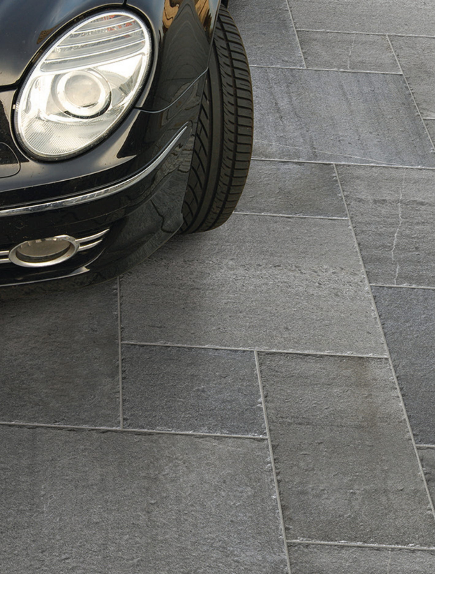
8"x8" | 8"x16" | 16"x16" Field Tile in Pieve