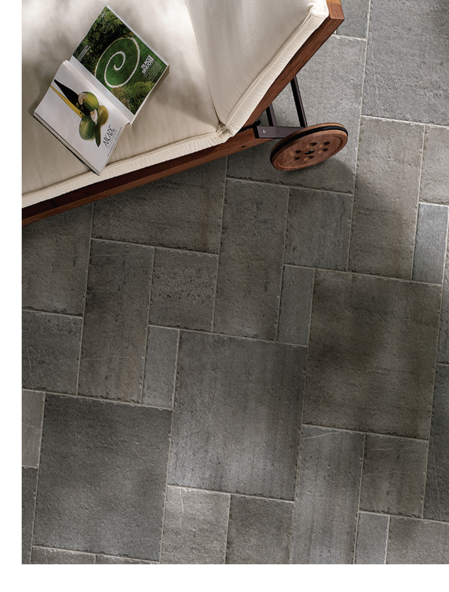
4"x8" | 8"x8" | 8"x16" | 16"x16" Field Tile in Rosta Nuova