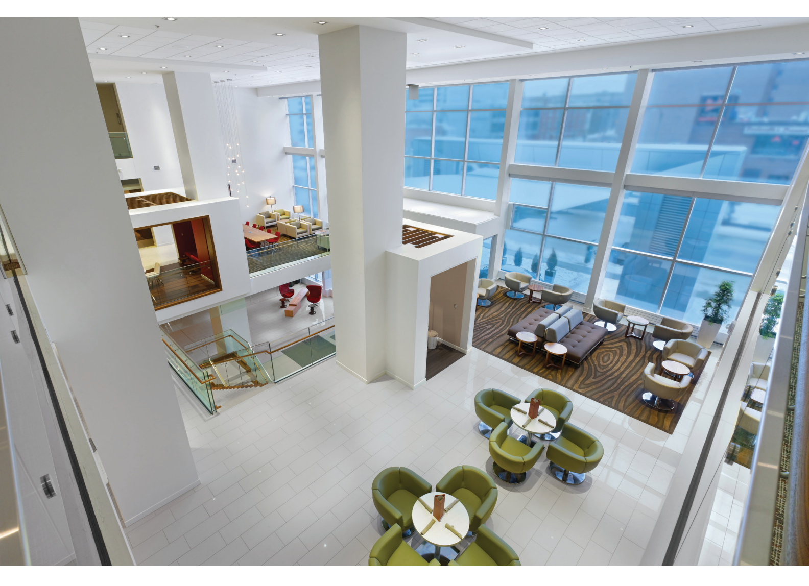
Shown From the Left Panel to Right Panel and Top to Bottom: