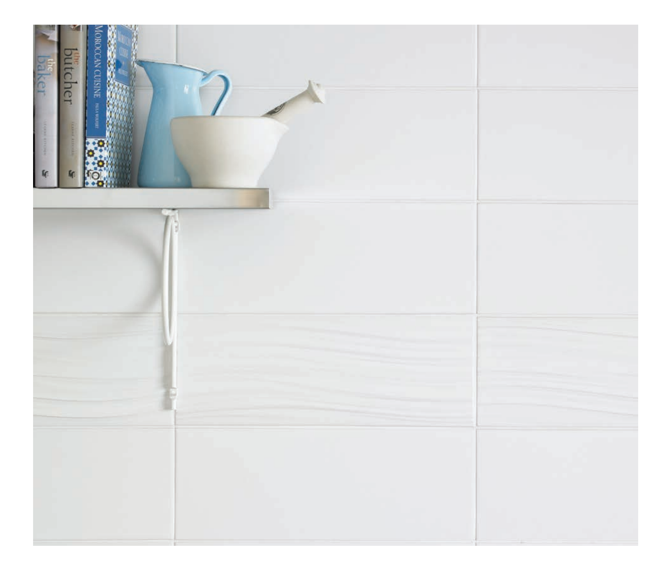
6"x16" Wave Wall Deco in White 6"x16" Wall Tile in White