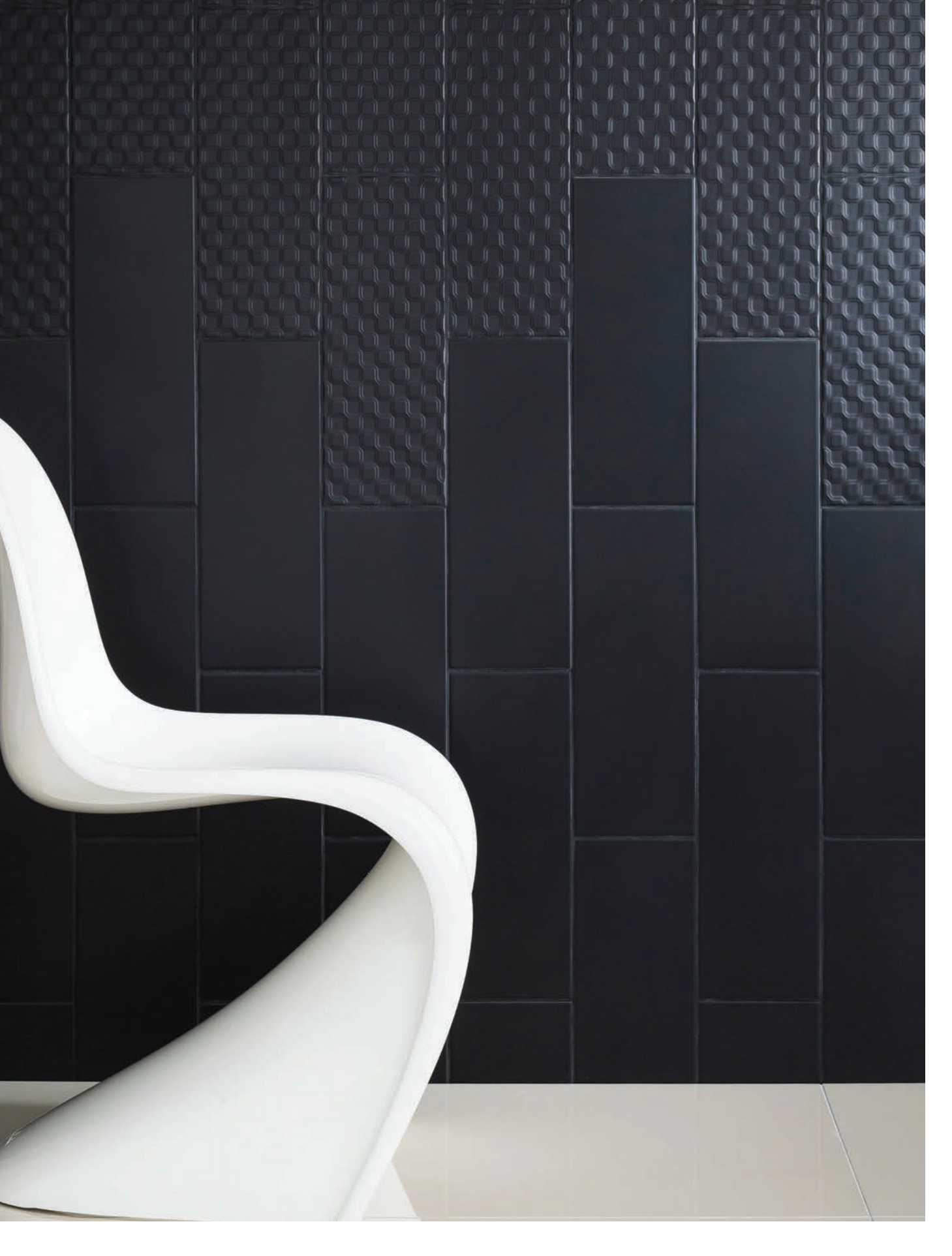
6"x16" Nano Wall Deco in Charcoal 6"x16" Wall Tile in Charcoal