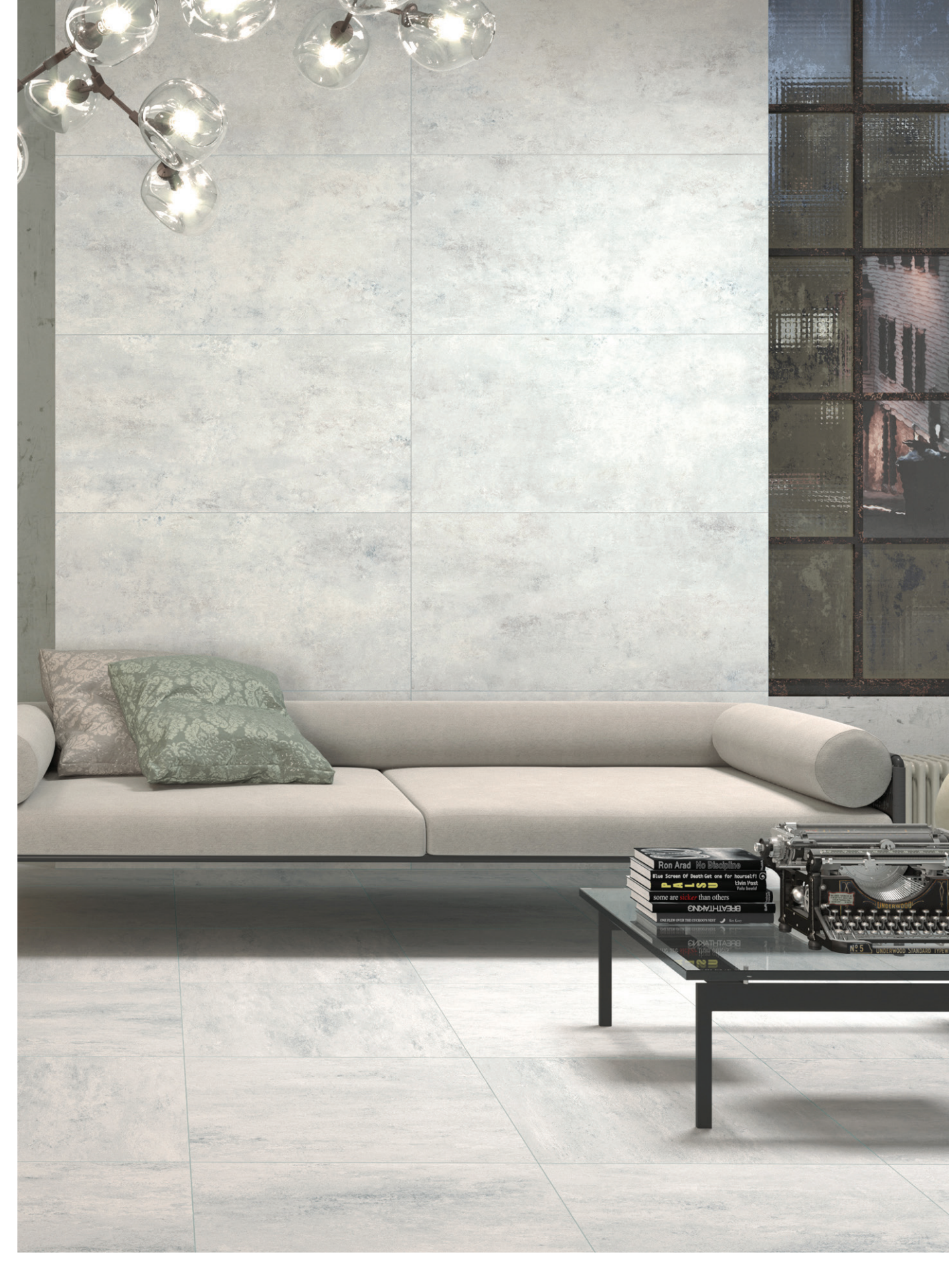
24"x24" Field Tile in Este 24"x48" Field Tile in Este