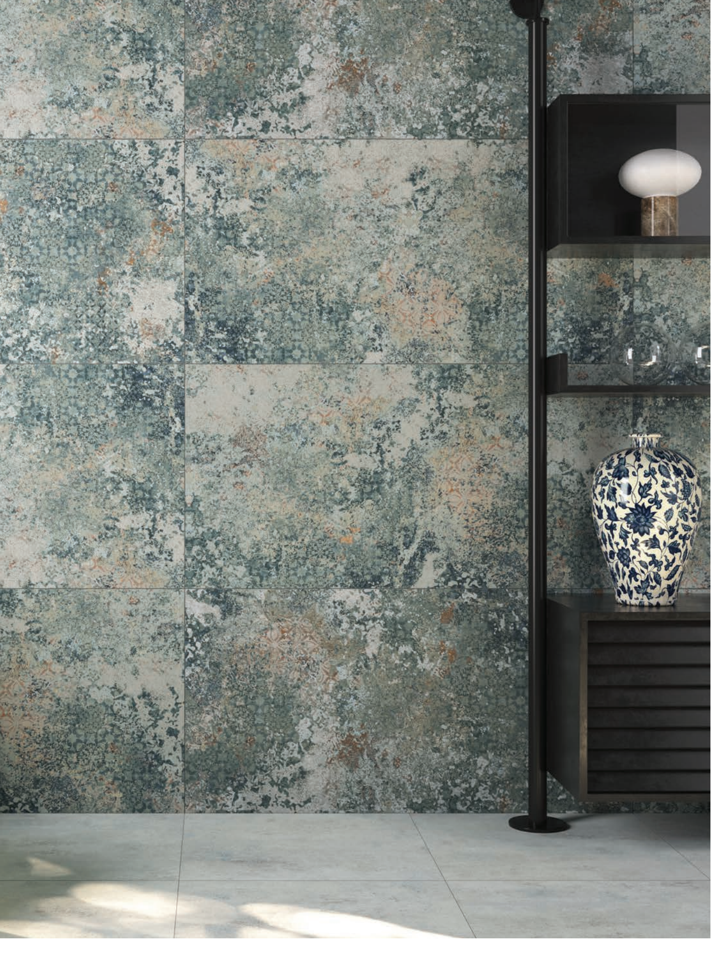
24"x24" Field Tile in Este 24"x48" Deco in Regio