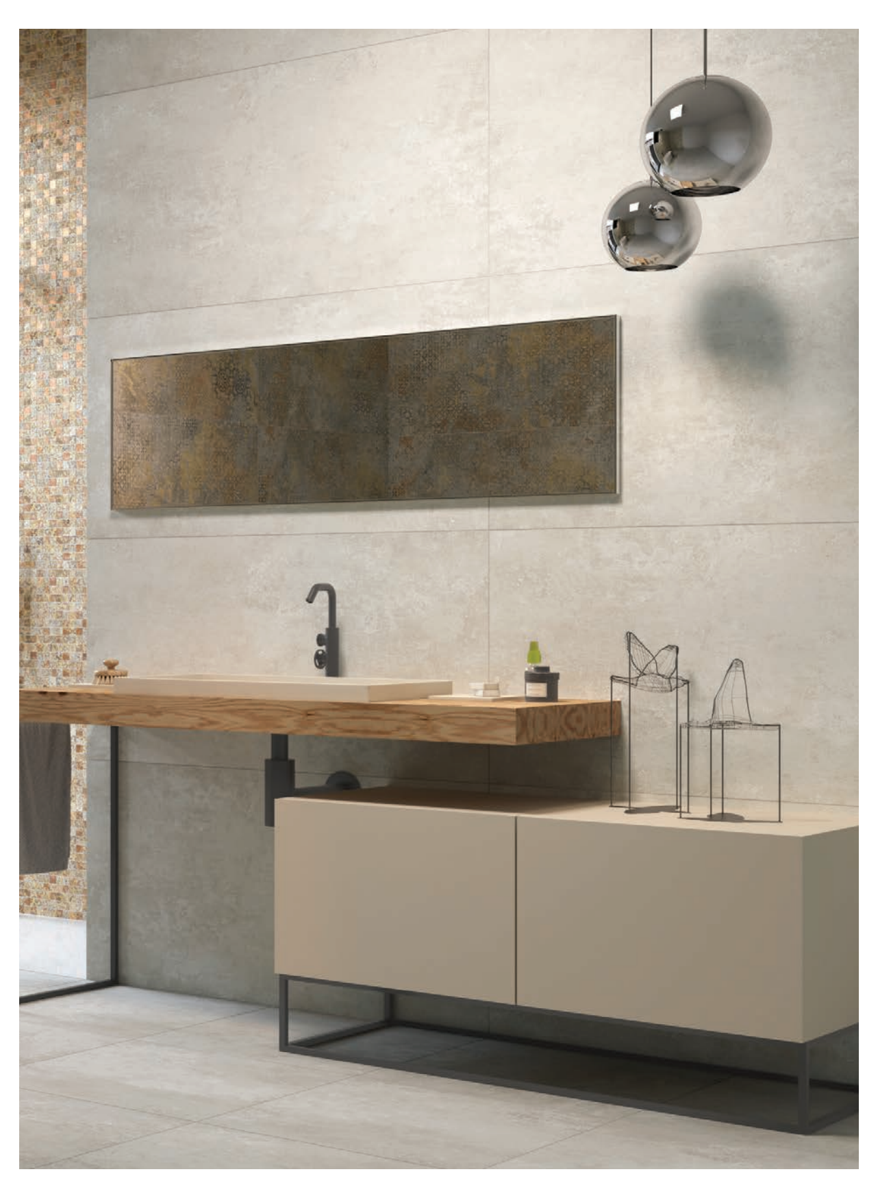
1"x1" Mosaic in Scaligeri 24"x24" Field Tile in Aragona 24"x48" Field Tile in Aragona