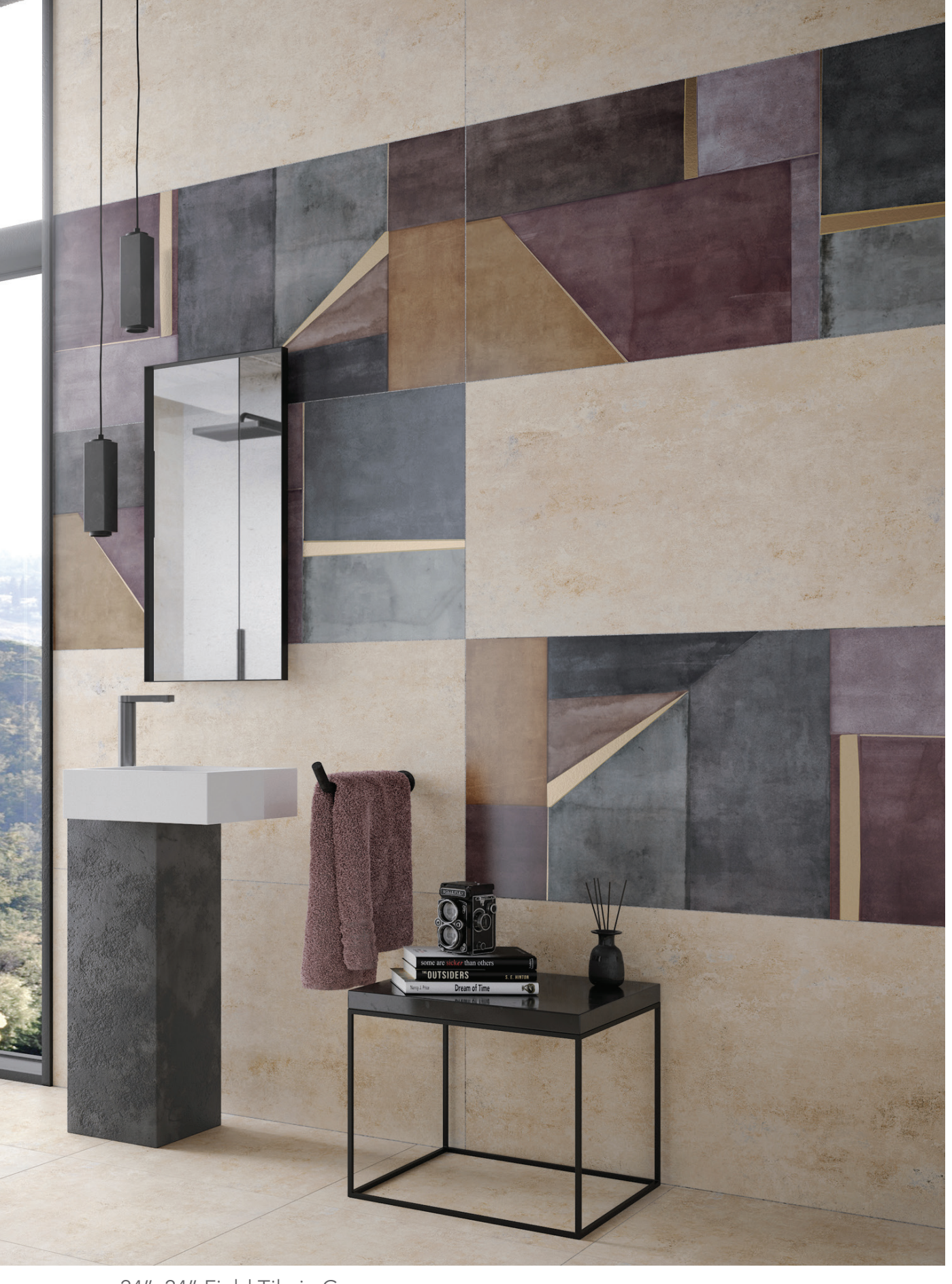
24"x24" Field Tile in Gonzaga 24"x48" Field Tile in Gonzaga 24"x48" Deco in Interni Mix