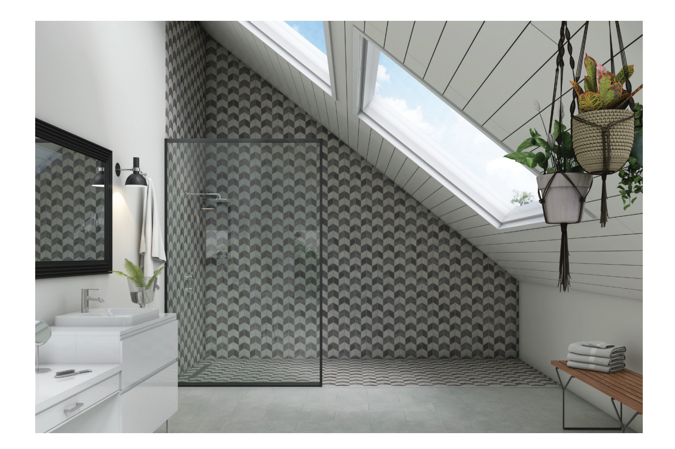
Mixed Chevron Mosaic in Cool Mix: Rush Gray | Torrent Black 12"x24" Field Tile in Rush Gray