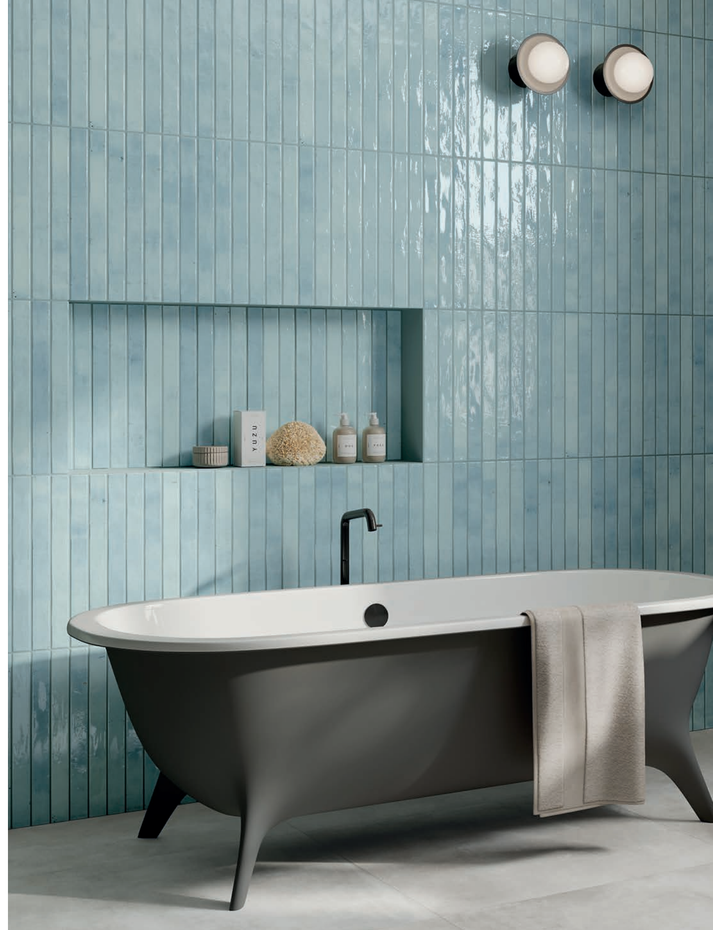
2" x 18" Field Tile in Sky