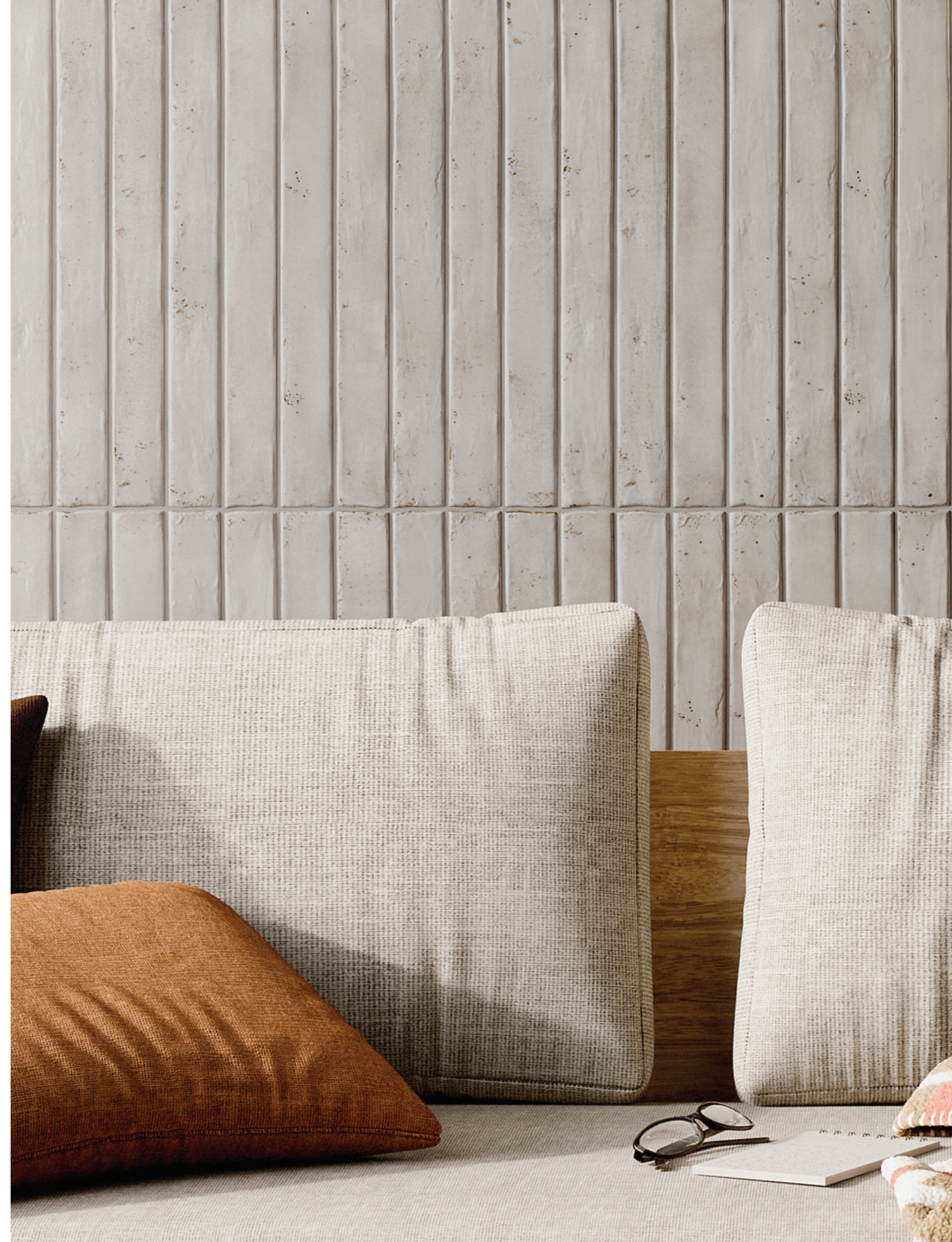
2"x 18" Field Tile in Light Grey