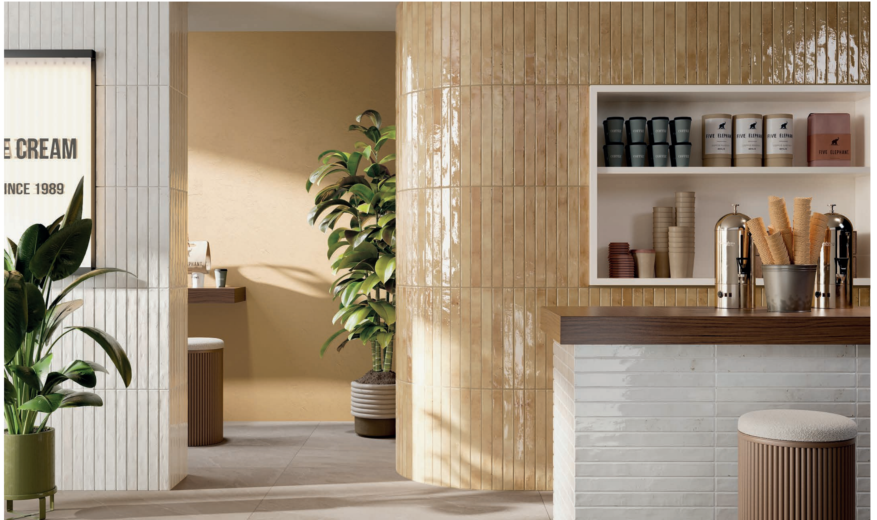
2" x 18" Field Tile in White and Beige