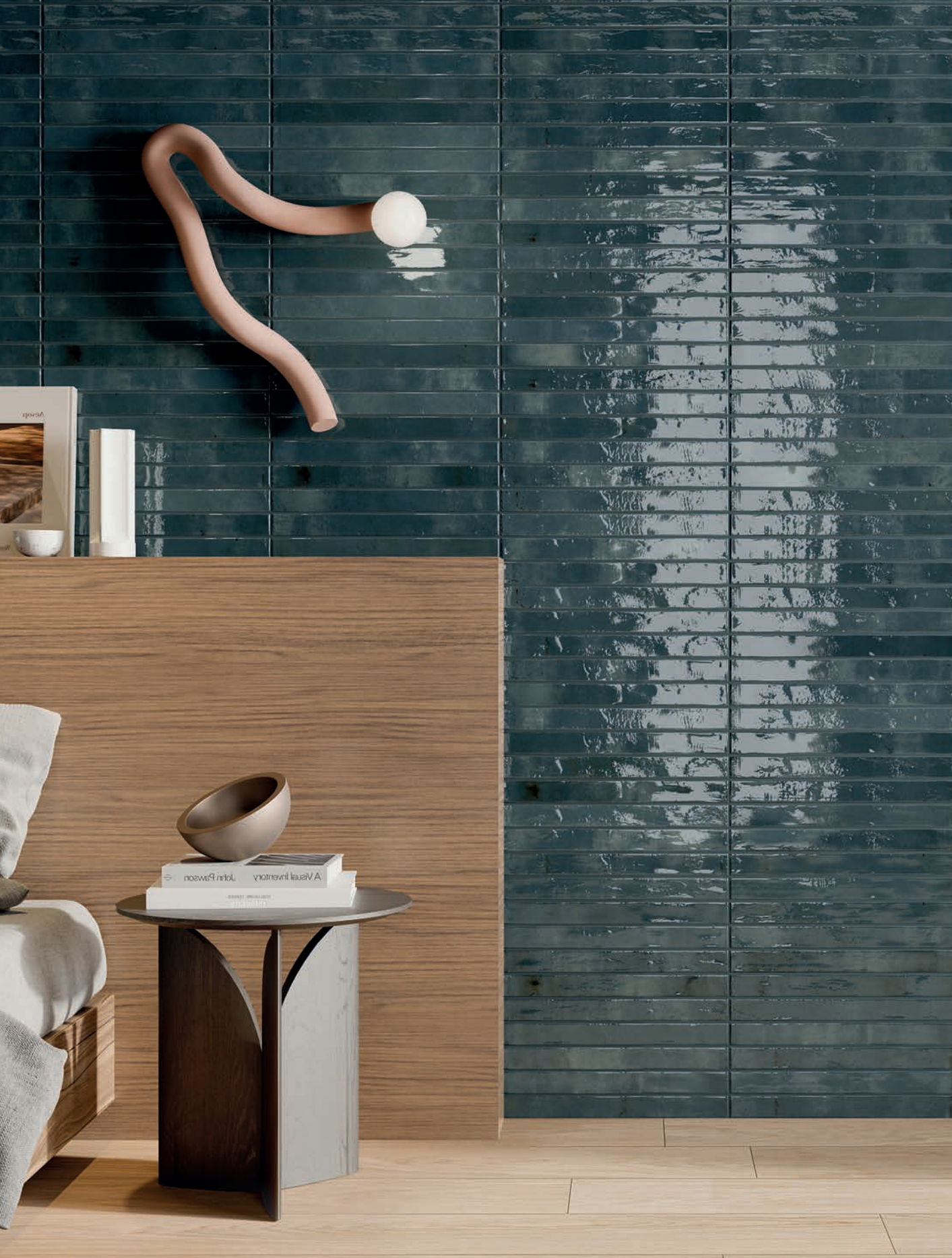
2" x 18" Field Tile in Blue