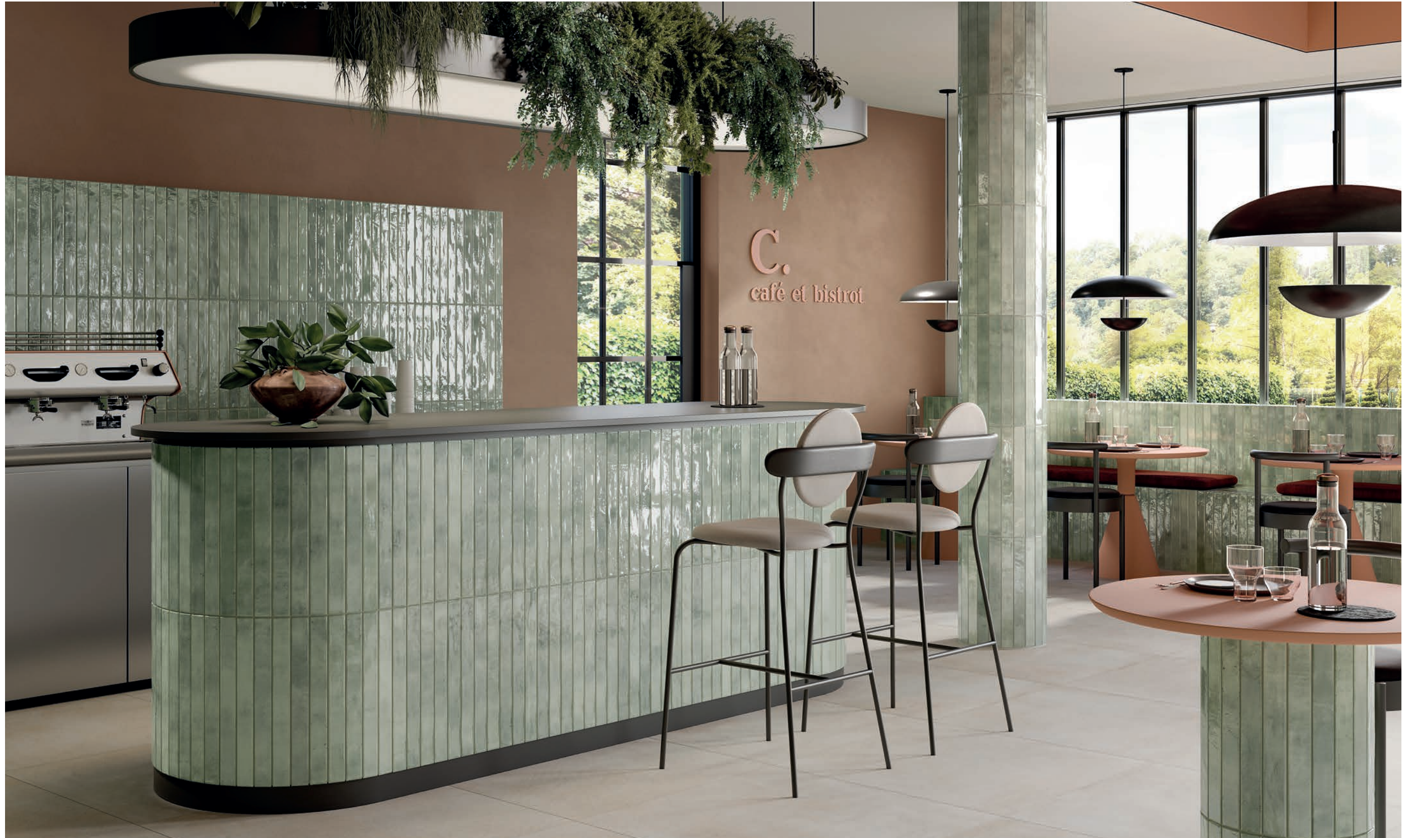
2" x 18" Field Tile in Aquamarine