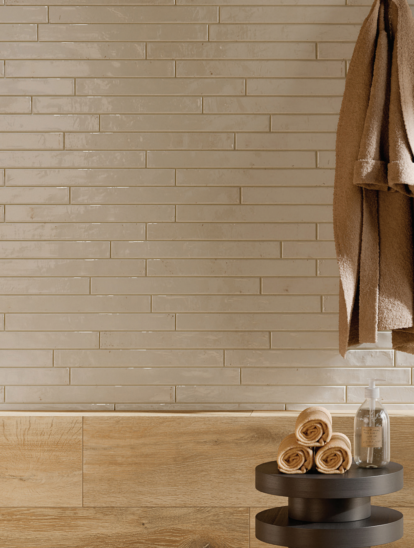
2"x 18" Field Tile in Ivory